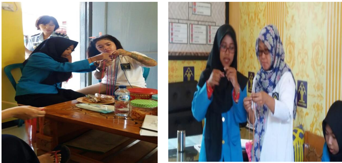
Figure 3. Submission of Material by Team

Correctional Institution and remarks from the supervisor and the head of the community service team, continued with the delivery of material regarding the manufacture of bags made of rope. Participants who attended this training were 7 female prisoners in Correctional Institution Ngawi.