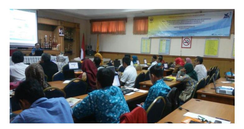
Figure 1. Training using SPSS features, and collecting data accordingly formulation of research problems

Community Partnership Program (PKM) High School Teachers in the City and Regency of Bandung were attended by 14 Mathematics Teachers from the Bandung City MGMP, and 17 Mathematics Teachers from the Bandung Regency MGMP. This training activity was conducted on May 30, 2018, guidance and mentoring was carried out from the beginning of June to mid-August 2018.