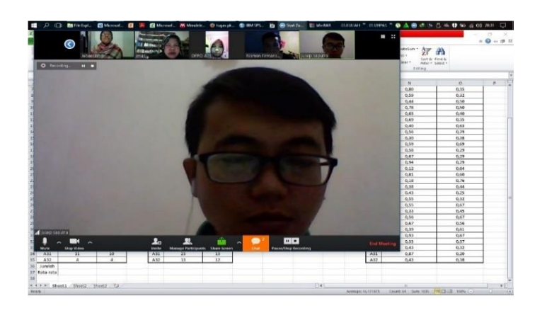
Figure 4. Guidance and Assistance Through Video Conference

The task was collected through e-mail pkm_math@unpas.ac.id, after which participants will present their assignments via video conference. Through vicon, the teachers will be guided and assisted when they find tasks that are considered wrong so that their tasks can be repaired and no longer do the same mistakes.