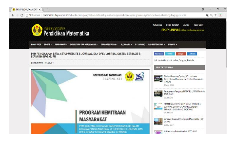
Figure 3. Guidance and Assistance Through the Web

Counseling and mentoring contains the delivery of the material that has been delivered during the training to remind the material that has been submitted that is poured through the web, besides that we also update or add the latest material that we share via the web, then there we also give assignments with help there instructions and steps on how to do it.