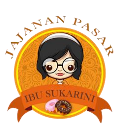
Figure 5. Product logo

The design that can be an option for partners can be seen in Figure 6. The plastic mica box that will be used for packaging donut snacks measuring 8x8 cm. In the previous packaging, the partner only used ordinary plastic and did not include the business identity.