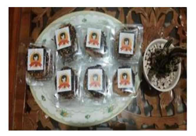
Figure 6. Donut Packaging With a Flavor Variant

This community service activity also requires an evaluation in providing outreach and assistance. Evaluation of activities is carried out by looking at the level of numbers from the results of partners' knowledge skills before and after the socialization and seeing sales figures in one month and analyzing the function of the packaging logo to function properly or not.