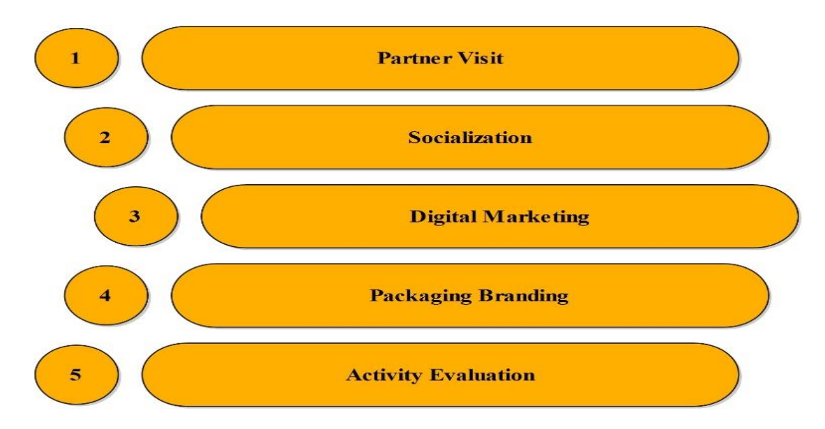
Figure 2. Implementation Method

Based on the problems that occur in the conditions of community service activity partners, the stages of the activity plan shown in Figure 2 are carried out.