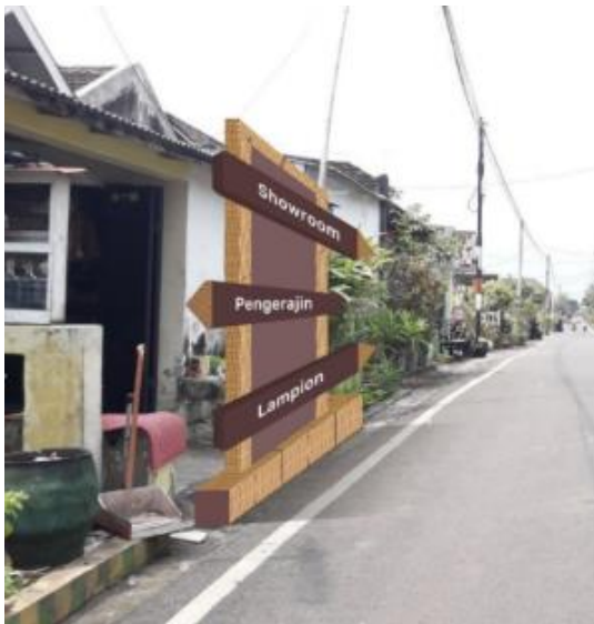
Figure 3. Digital Simulation for Sign System (Side View)