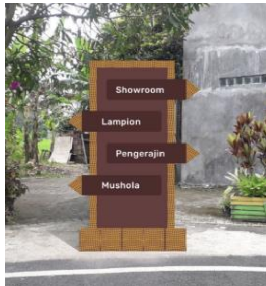
Figure 4. Digital Simulation for Sign System (Front View)

The drawing design and implementation of the design of the guide that has been made has received good appreciation from village officials and craftsmen in Tasik Madu Village. The next activity is the purchase and provision of road signs assisted by the community. The team is assigned to make the writing design and the community will help make the accessories that will be installed on the road signs. This activity is continued with the process of ordering road signs that have been obtained in October 2021. There are as many as 4 road signs that will be installed at the top on Jalan Karangploso and another iron guide that will be installed before the village gate. The implementation of the main activity, namely the installation of road signs, was carried out on October 15, 2021 together with the community and assisted by several village officials such as Pak Rw, and one of the craftsmen in Tasikmadu, Malang City. The installation of road signs was carried out at several points in accordance with the mutual agreement during the initial survey, namely at the entrance to the village and along the Tasik Madu road that required road signs.