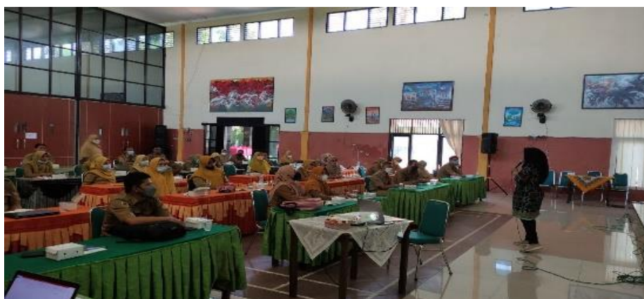
Figure 4. The Level of Plagiarism of Scientific Articles for Elementary School Teachers Participating in the Training

The results of reflections carried out after each activity session, the results showed that the teachers found it helpful to change the report form into a draft publication article. This is felt to increase the added value and improve the quality of the professionalism of each teacher. In addition, teachers also gain a new understanding of technological literacy by using the Mendelay software. The data from the draft articles produced by each teacher was carried out by the Turnitin test to determine the level of plagiarism. Turnitin's data shows that the level of plagiarism of participants' scientific articles is still high. Only 2% of training participants' articles have a plagiarism rate below 30%. The distribution of plagiarism levels of scientific articles by elementary school teacher participants can be seen in Figure 4 . This condition shows that teachers still need practice as a habit to compose paraphrases from quotes in reference sentences.