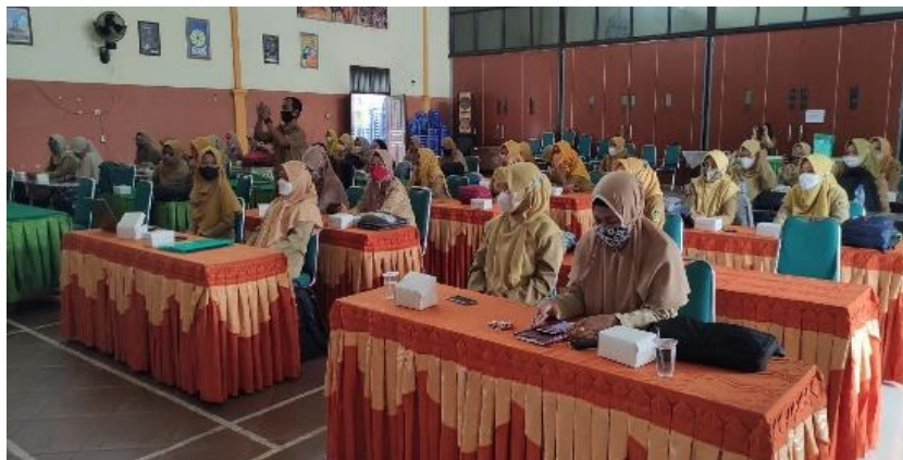
Figure 1. Kindergarten Teacher Participants in Scientific Writing Training Activities

Activities for compiling scientific publications in the form of book chapters for kindergarten teachers. There were 20 participants who took part in the preparation of book chapters from the Kindergarten level. Each kindergarten teacher compiles a book chapter in accordance with the activities that have been carried out in his class or school. Participants collect their assignments on a google drive link that has been prepared by the team. The activities is show in Figure 1 .