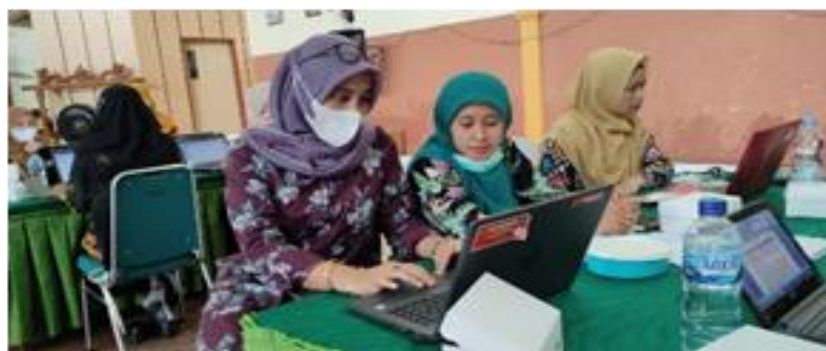
Figure 5. The Instructor is Providing Assistance to Junior High School Teacher Participants in the Scientific Writing Training Activity

There were 20 participants who took part in the preparation of book chapters from the junior high school level. Each junior high school teacher prepares draft articles based on CAR activities that have been carried out in their class or school. Based on the results of reflections carried out after each activity session, the results showed that the teachers found it helpful to change the report form into a draft publication article. This increases the added value and enhances the professional quality of each teacher. In addition, teachers also gain new understanding regarding technological literacy by using delay-based software. The activity of scientific writing training activities of junior high school teacher is show in Figure 5 .