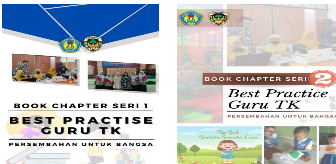
Figure 2. Cover Page of Book Elementary School Teachers in Scientific Writing Training Activities

Based on Figure 1, participants participated in the whole series of activities with enthusiasm and enthusiasm. The results of daily reflection based on the activities carried out show that teachers feel they have gained new knowledge, especially about how to write scientific publications in the form of book chapters. In terms of content, the average teacher already has the provisions to be poured in written form. However, technically, such as the ability to compose writing, understand the form of writing according to the template, arrangement and adjustment of content with previous references, it is still weak. The results of the book chapter will be compiled in the form of an ISBN book which is currently still in the confirmation stage with the participants due to the printing costs for the book. While the cover layout that has been prepared is show in Figure 2.