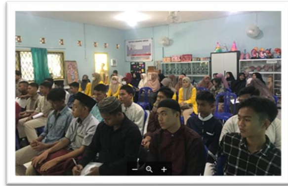
Figure 2. Education in Basic Islamic Economics & Finance

In addition, evaluation is also carried out through discussions with related parties such as school principals, teachers and students to get input regarding their needs to improve and improve community service programs in the future. From the results of the discussion, it can be seen that they need assistance in the field of knowledge and management of the halal industry (halal based-MSMEs). So this can be used as a consideration for implementing future community service programs. The development of MSMEs in the Islamic boarding-school area is very good for empowering existing economic potential because it has a positive impact on MSMEs around it, not only increasing business income but also knowledge of Islamic finance, including Islamic marketing methods. Evaluation is carried out by distributing pre-test and post-test related to the material presented and examples of their implementation in everyday life. The documentation is show in Figure 3 . Then the result of pre-test and post-test is show in Figure 4 .