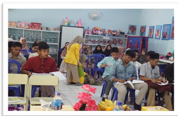
Figure 3. Pre and Post-Test Activity

In addition, evaluation is also carried out through discussions with related parties such as school principals, teachers and students to get input regarding their needs to improve and improve community service programs in the future. From the results of the discussion, it can be seen that they need assistance in the field of knowledge and management of the halal industry (halal based-MSMEs). So this can be used as a consideration for implementing future community service programs. The development of MSMEs in the Islamic boarding-school area is very good for empowering existing economic potential because it has a positive impact on MSMEs around it, not only increasing business income but also knowledge of Islamic finance, including Islamic marketing methods. Evaluation is carried out by distributing pre-test and post-test related to the material presented and examples of their implementation in everyday life. The documentation is show in Figure 3 . Then the result of pre-test and post-test is show in Figure 4 .