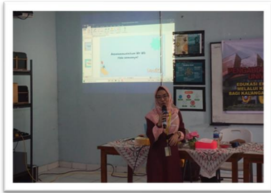
Figure 1. Socialization of Basic Islamic Economics