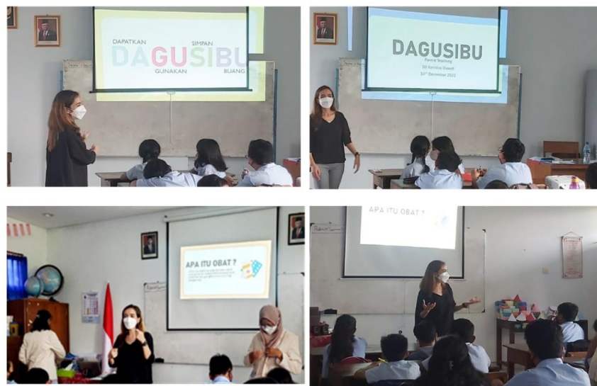
Figure 1. The Education Activity to the Students

Based on Table 1 , the population in total for this study was 77 students, divided into 38 students in grade V and 39 students in grade VI. In total, there were 33 male students (42.85%) who have distributed 12 male students in grade V and 21 male students in grade VI. Thus, the total of female students was 44 (57.15%), distributed to 26 in grade V and 18 in grade VI (Table I). Overall, the population of this study was dominated by female students, contributed from grade V. While the number of female students' number was less in grade VI. The documentation of education activity to the students is show in Figure 1 .