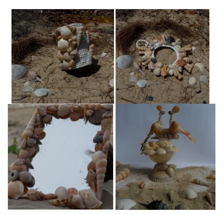
Figure 4. Products Produced from Shell Handicrafts

the skills to make handicrafts from seashells in the form of pencil boxes, wall hangings, mirror frames and miniature birds as shown in Figure 4.