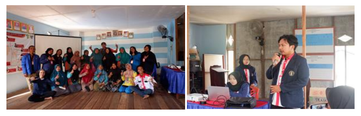
Figure 2. Socialization of Handicraft Making

the PKK women could practice them in the next session and this session ended with a question and answer by the PKK women. Socialization of Handicraft Making showed in Figure 2.