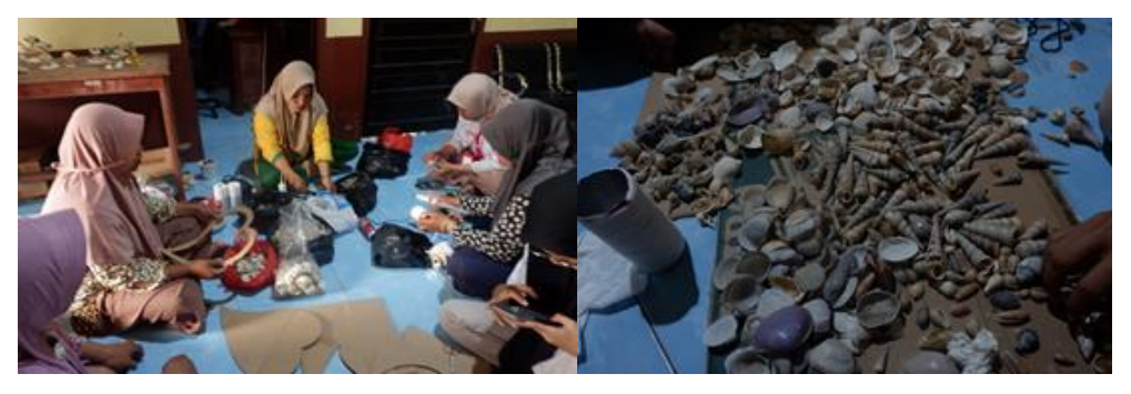
Figure 3. Practice Making Handicrafts with Participants

Second, practice making handicrafts, the second session was again attended by PKK women which was held on August 3 2023. In this session there was the practice of making handicrafts, before reaching this stage the women first looked for shell waste found on Kahona Beach. After the PKK women looked for shells, they cleaned the shells so that on practice day the shell waste was ready to be used as handicrafts. In this practical session, the mothers brought several handicrafts that they had made at home so that they could be used as examples for mothers who had not made any at all. In this second session, the enthusiasm of the mothers was very high because they really really innovate. and create high creativity in making these handicrafts. Practice making handicrafts with participants in Figure 3.