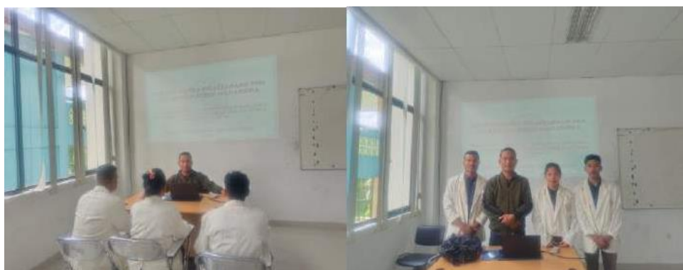
Figure 1. Pre-Implementation of Community Service Activities

Pre-implementation of activities was carried out by the community service team at the Santu Paulus Ruteng Indonesian Catholic University campus. In the pre-implementation stage, the team succeeded in determining the location and date of the event, selecting speakers, and developing a pretest and posttest. Documentation of pretest activities can be seen in Figure 1.