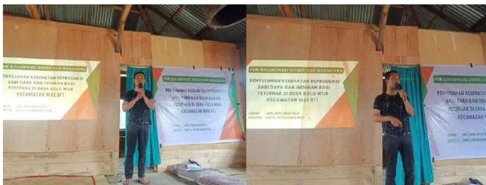
Figure 3. Speaker Explains Reproductive Health of Parent and Mother to Participants

Implementation of this activity involves socialization using the lecture method. Before the presenter delivers the socialization material, it begins with a pretest to assess the participants' initial knowledge. After participants fill out the questionnaire as a pretest, the presentation of the socialization material continues. In this socialization session, the presenters conveyed several important points, such as how to choose sires as sires, criteria for good sires as sires, the right age for mating sires, heat detection, signs of lust, and reproductive problems in sires. . For sows, the speaker provides knowledge about the reproductive cycle, observing signs of lust, the right time for mating, characteristics of pregnant animals, and problems or disorders in animal reproduction. Outreach activities are documented, as shown in Figure 3.