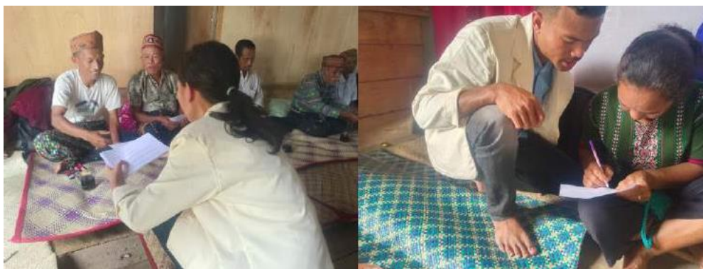
Figure 5. Atmosphere During Pretest and Posttest