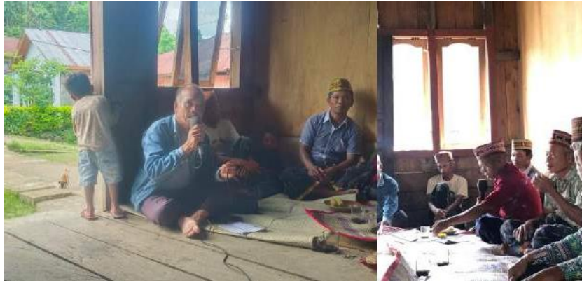
Figure 4. Discussion between Participants and Presenter