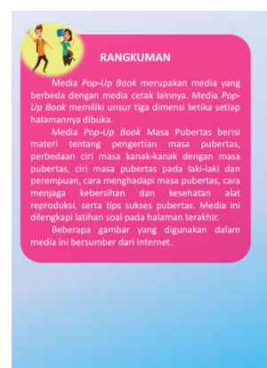
(b) Back Cover