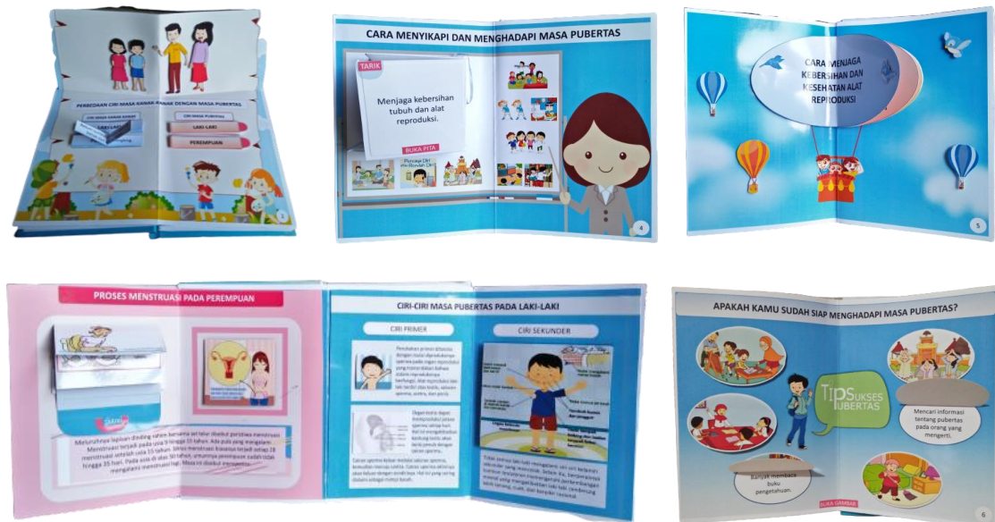
(c) The Media Pop-Up Book content