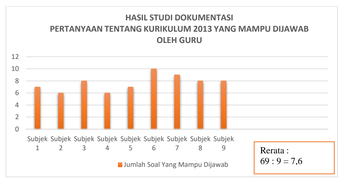
Figure 01. Diagram of the results of the Documentation study

These results indicate that the level of knowledge of SD Gugus II Kintamani teachers about the implementation of the curriculum is classified as good because it is at an average of 7.6. So that with this knowledge capital, teachers should be able to implement the 2013 curriculum well. This is also in line with the results of research conducted by (Makaborang, 2019; Rini Kristiantari, 2015) which states that the category of teachers who understands the 2013 curriculum is at a very high level, this means that teachers have sufficient understanding of the application of the 2013 curriculum.