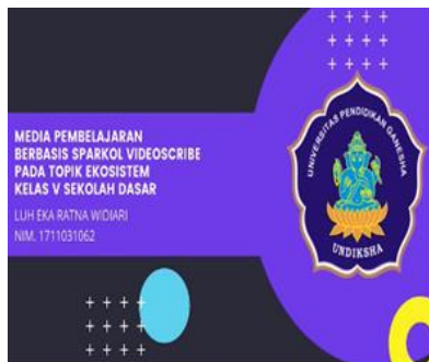
Figure 1. Coverpage Slide