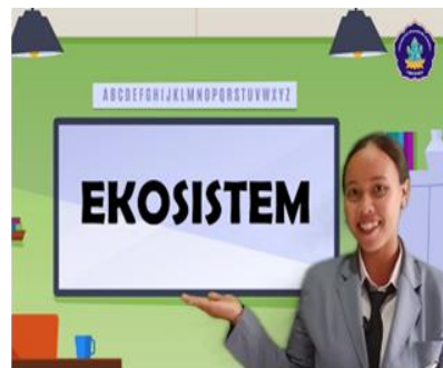
Figure 2. Topic Slide