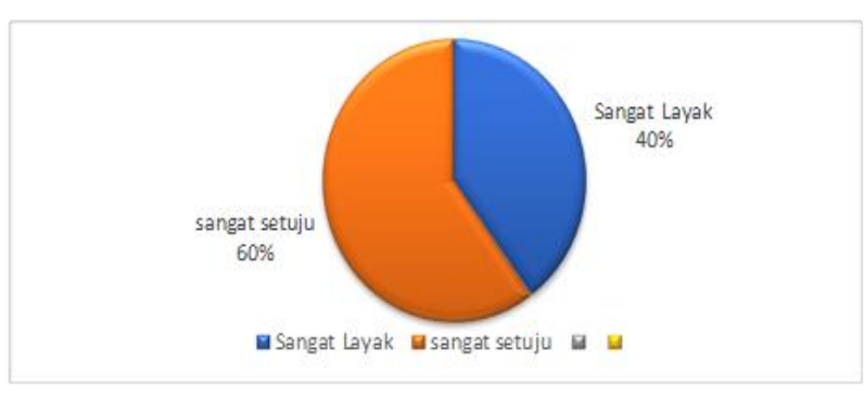
Figure 3. Results of Expert Assessment on Image Serial

Theoretically and practically, the feasibility test results on the developed media constructs, Early Childhood Education practitioners argue that the serial picture media and hand puppets developed in this study are very feasible and can be used to teach and stimulate language development receptively productively in young children. The results of the data analysis are presented in Figure 3.