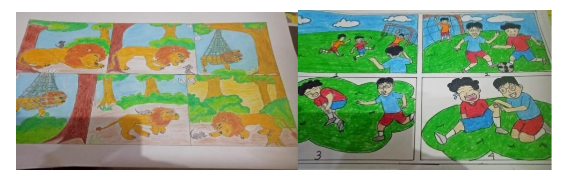
Figure 2. Results of Image Series Development

Theoretically and practically, the feasibility test results on the developed media constructs, Early Childhood Education practitioners argue that the serial picture media and hand puppets developed in this study are very feasible and can be used to teach and stimulate language development receptively productively in young children. The results of the data analysis are presented in Figure 3.