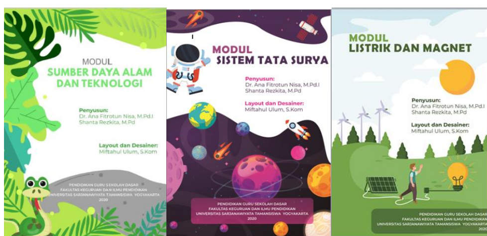
Figure 2. Natural Science Module

The fourth characteristic of this developed module is adaptive . This adaptive aspect is realized by a module that is developed to adapt to developments in science and technology, being flexible or flexible to use in various hardware devices. The developed module is designed with two types, namely hard file and soft file, this makes it easier for students to study anywhere and anytime, the worksheet is also presented with the file by first downloading the file link that has been provided. The fifth characteristic of this developed module is user friendly ; the developed module has simple instructions and information exposure is easy to understand, and uses commonly used terms. The sixth characteristic that this development has is its interesting graphic aspect. This aspect is evidenced by the developed module which is designed in full color, colorful and attractive covers, and various visualizations of images that follow the material discussed. The results of the development of the science module are presented in Figure 2 .