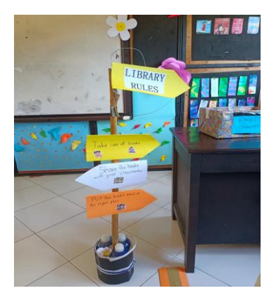
Figure 3. An LL Poster at the Library as Students' Legacy Project

Additionally, the poster at the gate is to inform parents that the theme of the week is about fairness, keadilan , and sadulur . With this as a reminder, parents can facilitate their child in learning at home to focus on the theme and make sure all assignments are accomplished. A legacy Project at the school is defined as a project that is "left behind" by Grade 6 students upon graduation. The aim is to benefit younger students, have younger students remember and be inspired by their graduated seniors and to instill pride and kindness in the graduates as a last gesture upon graduation as they head to junior high school. This project leans heavily on character education and life skills, which are core to the school. As with all projects at the school, students were central to the process and responsible for the product at the end of the Library Legacy Project. The student-centered activity is characterized by the student active involvement in the project. In order to engage them in the project actively project is preceded by introduction to the concept of legacy. Then, all students are taken to the library which has been unused for two years. In the library, the students in their group are assigned to explore things which can be improved through discussion in the group. Results of discussion are presented and the final stage is to execute the decision. The success of the project is partly measured in the creative and beautiful decorations as shown in Figure 3.