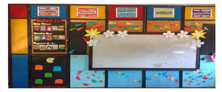
Figure 1. An LL Poster for PLS on the Wall

Every week, 1 class / teacher from grades 4-6 has some responsibility for the program. Every Monday, the school has a short (10-15min) assembly on the playground, to introduce the theme of the week. The responsible class prepares (in advance of Monday) a POSTER with the theme. The poster is trilingually written (Bahasa Indonesian, English, and Balinese). The poster is used to introduce the theme and then posted on the gate / at the front of the school, reminding parents or visitors what the theme is for the week. The class responsible, explains the theme and gives positive examples to the rest of the school. Figure 1 shows posters are on the wall during PLS project.