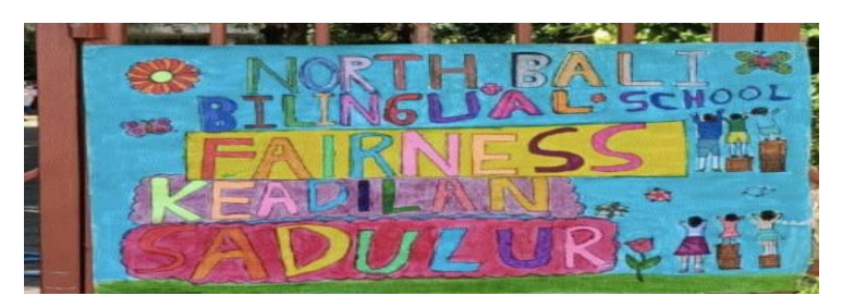
Figure 2. An LL Poster on the Gate

Base on Figure 2, the poster puts the identity of the school at the top followed by the theme of the week in English, Bahasa Indonesia, and then Balinese. English is still the salient language as it is placed at the top most among the other two languages. Irrespective of the school name, Bilingual School, the poster is actually multilingual as it contains three words from three different languages. This might suggest that the school also complies to the local government policy which prescribes that public institution should encourage the use of Balinese.