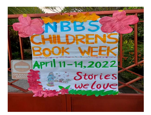
Figure 5. Annual Book Week Event

The poster in Figure 4 represents the LL made for the events as a part of socializing information. The poster has a unique way to promote safety on the Internet. The poster uses the word internet as an acronym by defining the meaning of each letter. The poster is bilingual by first defining the letter I using Bahasa Indonesia, Ingat jangan membuka link sembarangan , which means 'Never open any unclear link'. English definition is then used in the letter E, 'Big no for hoax'. The poster shows that the salient language used is Bahasa Indonesia. This case is different from the previous case in which the the salient language is English. The use of Bahasa Indonesia at the top has the purpose to facilitate reader understanding, thus, to promote literacy, especially, for students whose English is not well developed. This project is implemented at the school as an application of LL utilized for celebrating annual events. The projects were collaboratively made by the students as a part of their academic assignment and also as a part of media for sharing the events to the school members. Figure 5 indicates the monolingual poster in English.