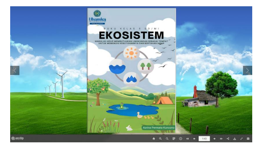
Figure 1. E-book Design

The findings of Table 2 survey indicate that integrating learning media into classroom learning is imperative to facilitate students' comprehension and assimilation of learning concepts. This measure is deemed necessary to enhance the accessibility, attractiveness, and convenience of the learning process, thereby enabling students to learn and comprehend the subject material more effectively. This paper outlines the process involved in creating e-book learning materials utilizing the Anyflip platform. The subsequent procedures delineate the process of compiling a media design for an Anyflip e-book. 1) Examining the issues and requirements of students, 2) Establishing objectives and formulating blueprints or drafts for the e-book. 3) Design learning media customized for natural science subjects, explicitly focusing on ecosystem-related content. The development process involves three key stages, gathering relevant materials, establishing a conceptual framework, and formulating evaluative questions. Using these learning resources, the ultimate goal is to enhance students' cognitive abilities. 4) The process of conducting validation tests involves the participation of material experts, media experts, and language experts. Subsequently, the tests are administered to students in a classroom setting. 5) Performing an assessment to furnish input on the creation and subsequent execution of e-books. The results of the Anyflip ebook design are shown in Figure 1.