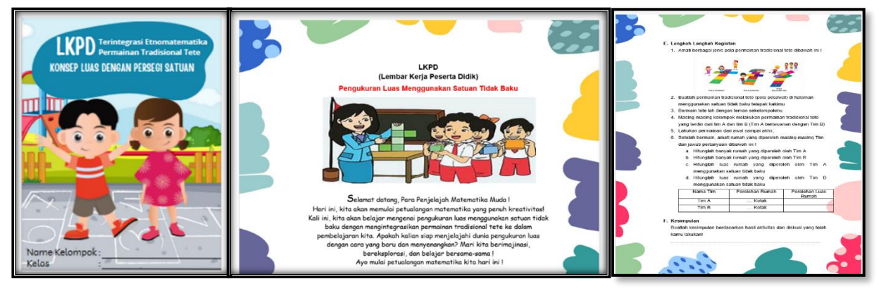
Figure 2. Results of the Development of an Integrated Ethnomathematics Student Worksheet