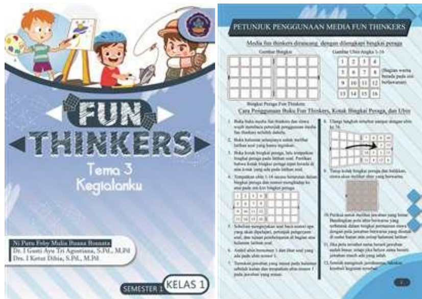
Figure 1. Fun thinkers Media Design Based on Fill the blank questions