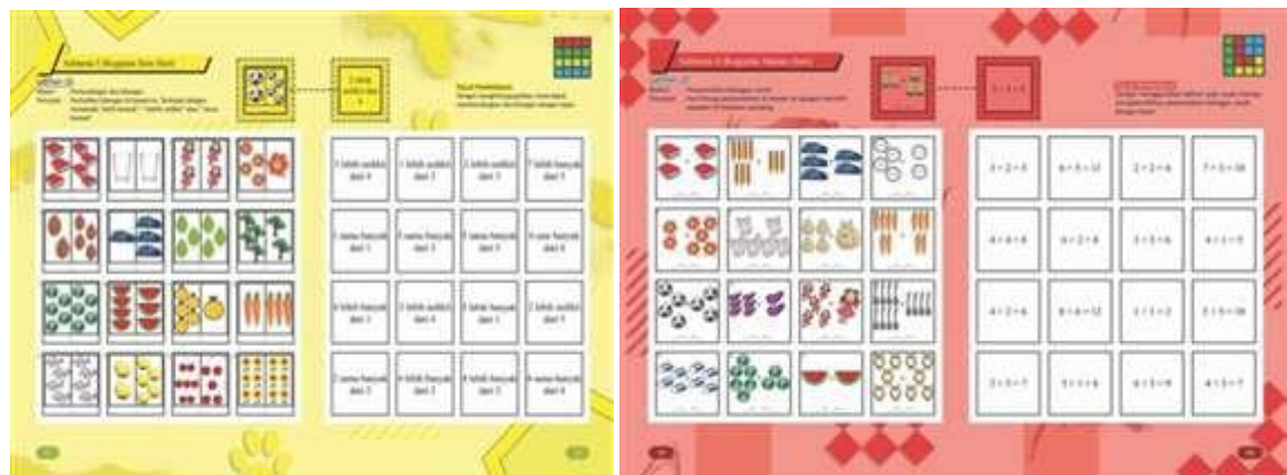
Figure 2. Results of Fun thinkers Media Development Based on Fill the blank questions