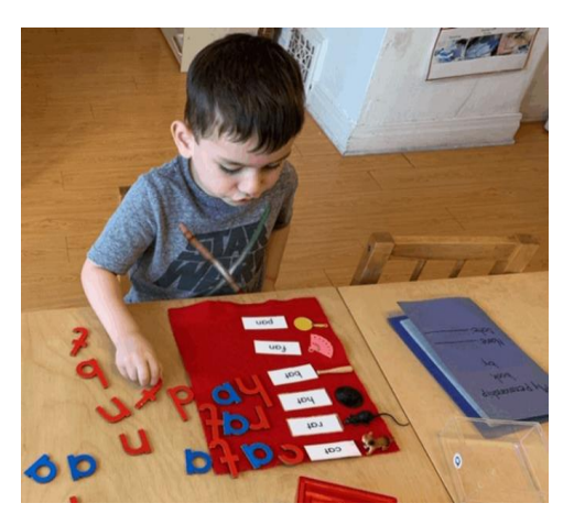
Figure 4. Activity of Matching the Alphabet Letters with the Words According to the Items Picture

The learning activities in the language domain primarily focus on developing children's language skills through the use of games (Caballero et al., 2022; Demirbaş & Şahin, 2022). A practitioner in this field can facilitate educational exercises by employing word associations that correspond to the topics explored in the classroom. Students will be invited to engage in activities where they will pair photographs of clean living materials with corresponding letters of the alphabet to form a statement that accurately represents the presented picture. This educational exercise will enhance students' linguistic abilities while instilling in them the need of acquiring knowledge about maintaining a hygienic and healthy lifestyle. Activity of matching the alphabet letters is show in Figure 4.