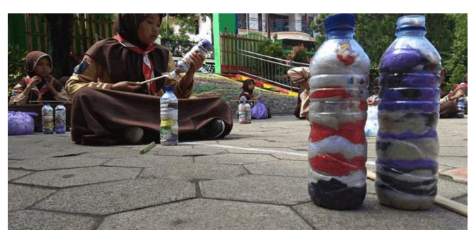
Figure 7. Visualization of Learning Activity by Drawing and Making Eco Brick for Understanding the Clean-Living Value by Considering the Environment Cleanliness