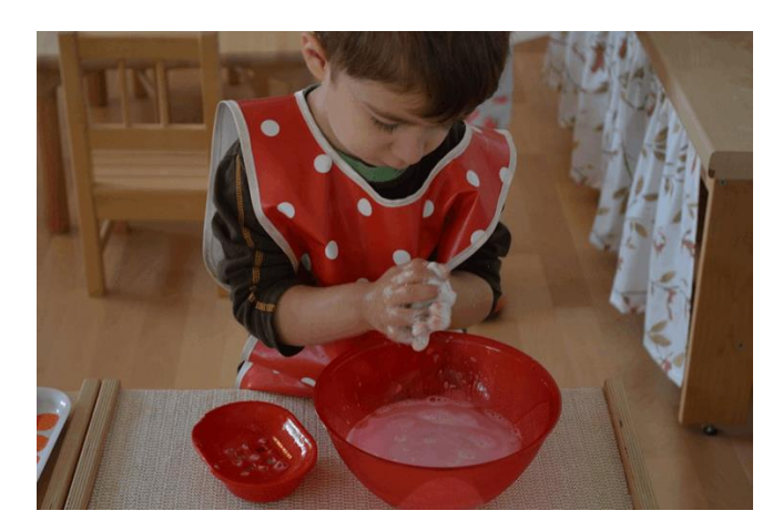
Figure 2. Activity of Washing Hand

Within the domain of practical life education, students acquire knowledge and skills pertaining to a wide range of daily tasks (Day et al., 2019; Vatansever & Ahmetoğlu, 2019). An instructor might create instructional activities centered on hand washing to impart practical knowledge to pupils regarding hygiene practices in their everyday lives. This hand washing activity aims to acquaint children with the precise and accurate technique of hand washing, as well as emphasize the importance of cleanliness. The primary objective of this learning activity is to promote the importance of maintaining a hygienic lifestyle by engaging in everyday tasks within the context of practical living. Activity of washing hand is show in Figure 2.