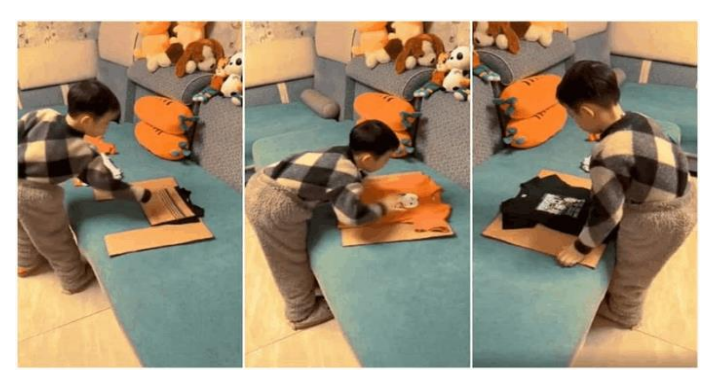
Figure 1. Activity of Clothes Folding

Within this educational realm, educators have the ability to craft instructional experiences by using interactive learning exercises that promote students' comprehension of cleanliness and organization, all while infusing an element of enjoyment. Folding involves the act of neatly arranging and creasing fabric items such as clothing, t-shirts, and blankets. This activity helps promote the development of children's motor skills while also teaching them about cleanliness (Field & Temple, 2017; Meilati et al., 2021). The folding clothing activity aims to cultivate a child's habit of maintaining cleanliness by encouraging them to organize their own garments. Amidst educational endeavors, it is imperative for a teacher to conscientiously elucidate the significance of upholding cleanliness from an Islamic religious standpoint to students, while underscoring that cleanliness is an integral component of faith. Here is a learning activity related to clean living in Islamic studies that a teacher might implement as show in Figure 1.