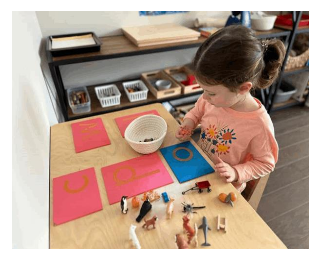
Figure 3. Visualization of the Activity in Matching the Item Name with the Alphabet Zone

Sensory learning is an educational practice that emphasizes the stimulation of children's five senses, including olfaction, tactile perception, auditory perception, gustation, and vision (Schonleber, 2021; Sheromova et al., 2020). Within this domain, an instructor has the ability to create educational exercises that include associating images with specific areas. This educational exercise aims to engage a child's five senses in order to promote an understanding of the importance of cleanliness. The activity involves matching photos that depict clean living to the corresponding letters of the alphabet, as show in Figure 3.