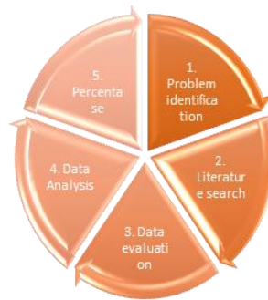
Figure 1. Research Stages

Contains The researchers used an integrative literature review method to conduct a research approach that involved reviewing, criticizing, and synthesizing relevant literature on a topic in an integrated manner and determining the direction of future research. The researchers systematically identified, collected, and evaluated relevant scientific publications from various sources from 2014-2023 to ensure good representation and relevance to the research of the last 10 years. A critique and analysis of the collected literature was conducted, followed by a synthesis to integrate the main findings and build a new framework or innovative perspective (Dhollande et al., 2021; Souza et al., 2010). The research stage is show in Figure 1.