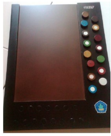
Figure 2. The Picture of Media Designed

Since the media was designed with a purpose to help the fifth grade students of elementary school in reading English words, sentences, or even very simple texts, and by considering the characteristics of good media, this media was named as CALF. CALF stands for Contextual Attractive Logic Fun. That name was chosen because the media could give contextual texts with attractive color and pictures which could be applied in logic and fun situation. The concrete illustration could be seen in the following picture.