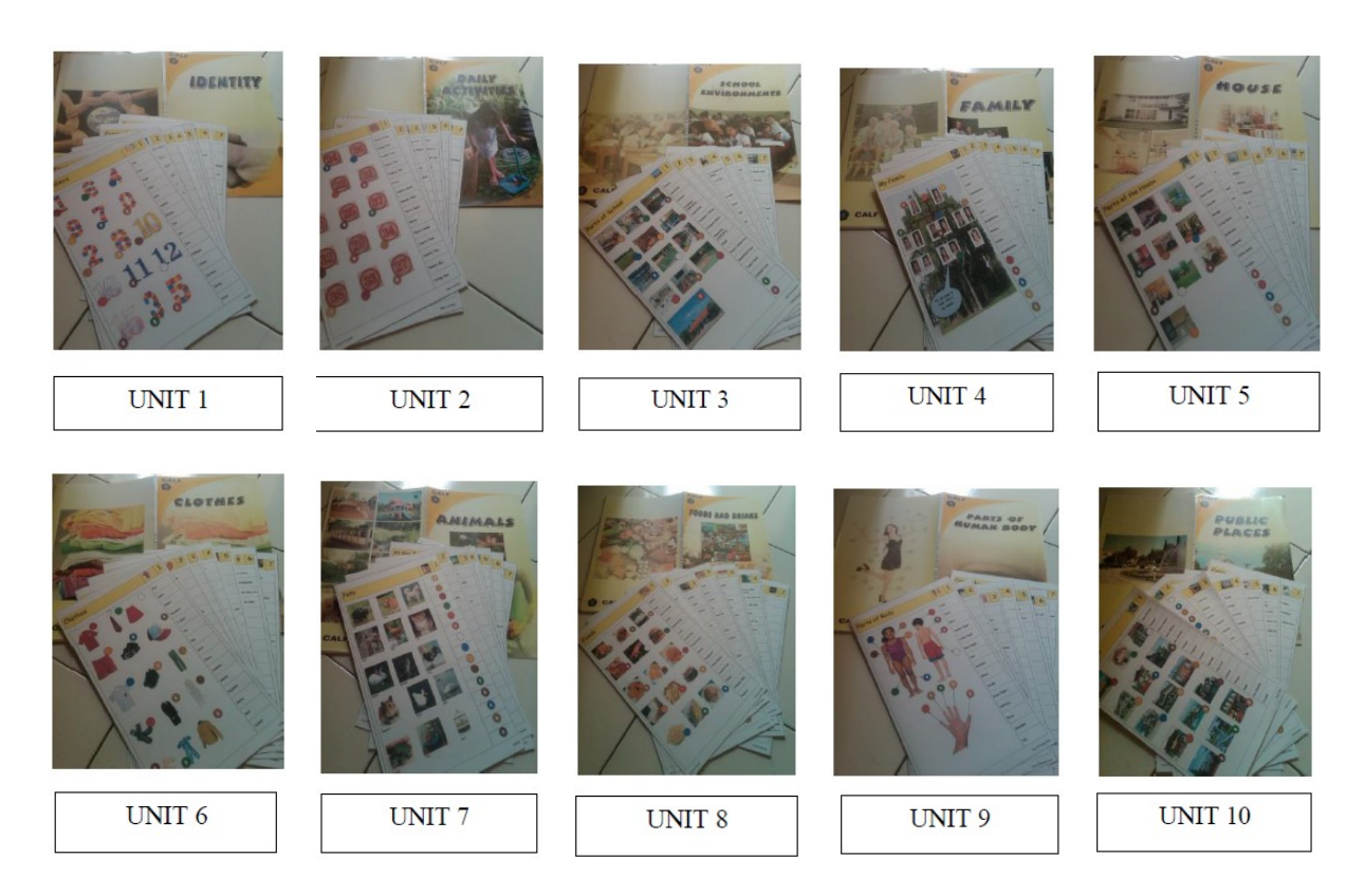
Figure 3. The Picture of Supporting Material Designed

There were two experts who became the judges of this study, one is a lecturer of educational technology, and another one is a lecturer of English education. Those two judges judged the media developed based on the rubric designed by the writer. The rubric was based on the indicators in syllabus used in those settings, the criteria of good media by Zaman & Eliyawati (2010), and the criteria of good material by Tomlinson. There were also three items that should be filled by the two judges; they were the general comments toward the media developed, the weaknesses of the media developed that should be minimized, and the strengths of it that should be defended.