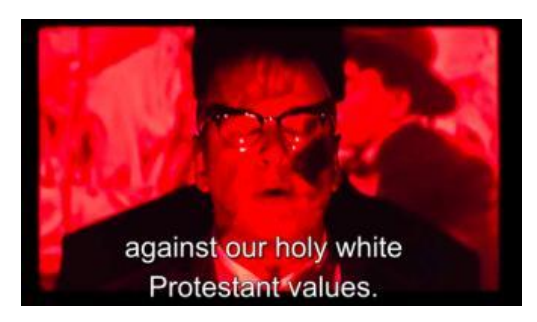
Figure 4. Taboo Language of Profanity Type in Sequence 2b

controlled by Jewish. It could be understood by the word puppet. Puppet was an object commonly resembled human, animal or mythical things in which controlled or animated by puppeteer. The puppeteer that the white man in the BlacKkKlansman film referred was Jewish. The white old man was blaming the Brown Decision because the laws stated that the racial segregation in the public school was unconstitutional and it made them (white people) shared the same school with inferior race or the other race besides white and they believed that the Brown Decision of U.S Supreme Court was controlled by Jewish. The white racist people such as the white old man in the Blackkklansman film was showed their political ideology of anti-Semitism.