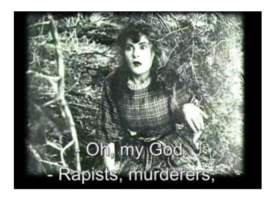
Figure 7. Taboo Language of Obscenity Type in Sequence 2b