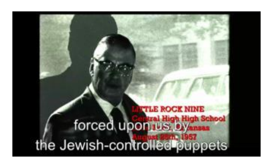
Figure 3. Taboo Language of Profanity Type in Sequence 2b