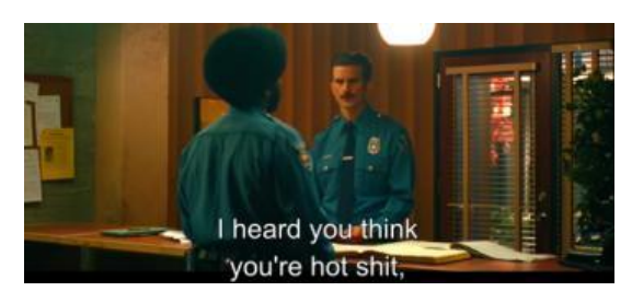
Figure 6. Taboo Language of Vulgarity Type in Sequence 9a

statement was clear. The old white man defined the white women as a holy person, someone that should be protected. They did not want that the white women were being sexually harmed by the black or African-American men. Thus, this showed the hatred of the old white man toward African-American with the prejudice that they craved white women.