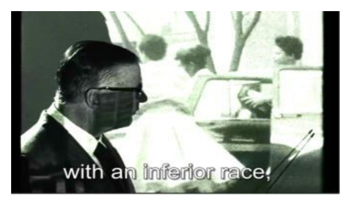
Figure 1. Taboo Language of Epithet Type in Sequence 2b