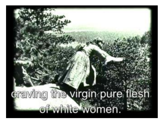
Figure 5. Taboo Language of Vulgarity Type in Sequence 2b