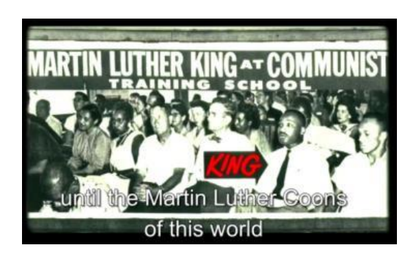
Figure 2. Taboo Language of Epithet Type in Sequence 2b

meaning was the old man was mad that the white children should share the same school with inferior race. The inferior race refers to the Afro-American people. From the Jim Crow era there was a segregation of colored people or Afro-American to go to school with white people. Even though the era of Jim Crow was ended the white people still refused to go to school with inferior race or they still share the same school but avoid them in the society because the superior group thought that their group was not appropriate to socially connected with inferior race.