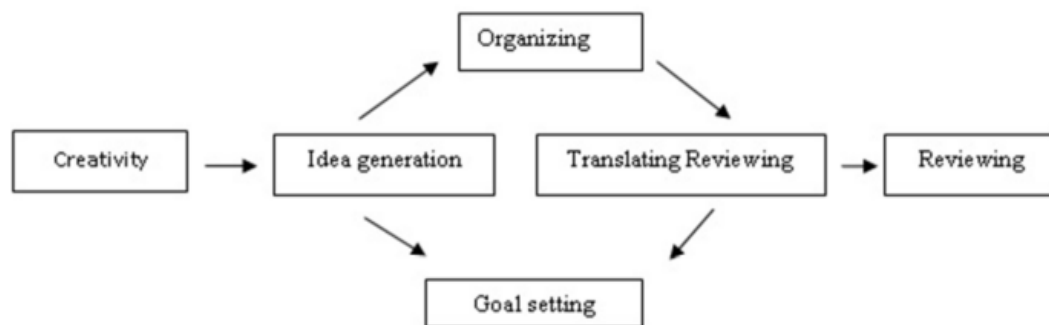
Figure 1. The relationship between creativity and writing (Flower & Hayes, 1980)

Flower & Hayes (1980) elaborate that writing process involves planning, translating and reviewing. Planning comprises of generating idea, organizing idea and setting the goal. Translating comprises of producing language that is in line with the ideas from the writer's brain. In this case, creativity plays a crucial role in producing ideas in planning process. Flower & Hayes' (1980) model of creativity in writing is presented in the following figure.