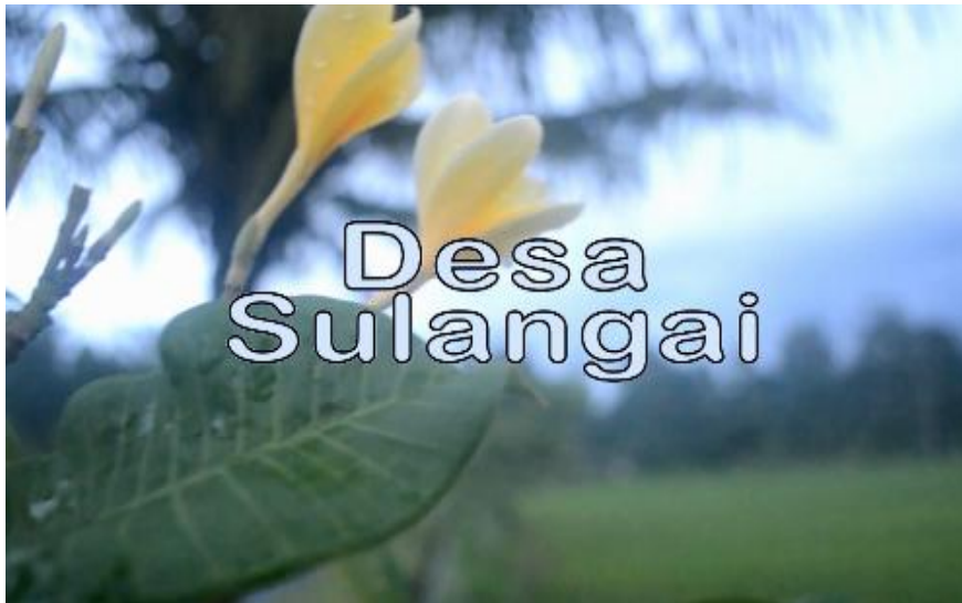
Figure 5. Displaying Sulangai Village