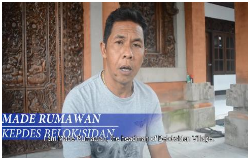
Figure 6. Displays the interview with public figure