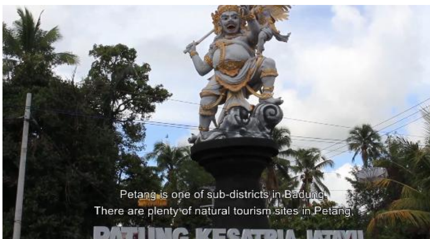
Figure 4. Displaying a video of the natural potential

Figure 5. Displaying Text for each village in Petang sub-district, starting with Sulangai Village. Text for each village in Petang sub-district, starting with Sulangai Village. Figure 6. Displays the interview by the resource person, namely the Village Head of Beloksidan / Deputy Village Head / Community Figure. In addition to the village of beloxidants, all village leaders in the evening sub-district were also interviewed such as Sulangai, Plaga, Getasan, Pangsan, Carangsari Villages. Then Figure 7. Displays the Text "Final Project Video Promotion Media Information Petang District Badung District". At the end of the video shows a credit that can be seen as Figure 8.