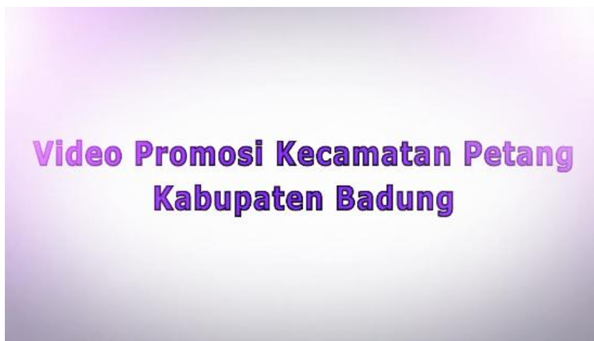
Figure 3. Displaying a video with the text