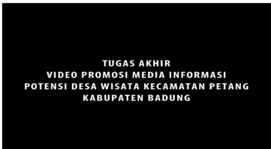
Figure 7. Show Text Final Project