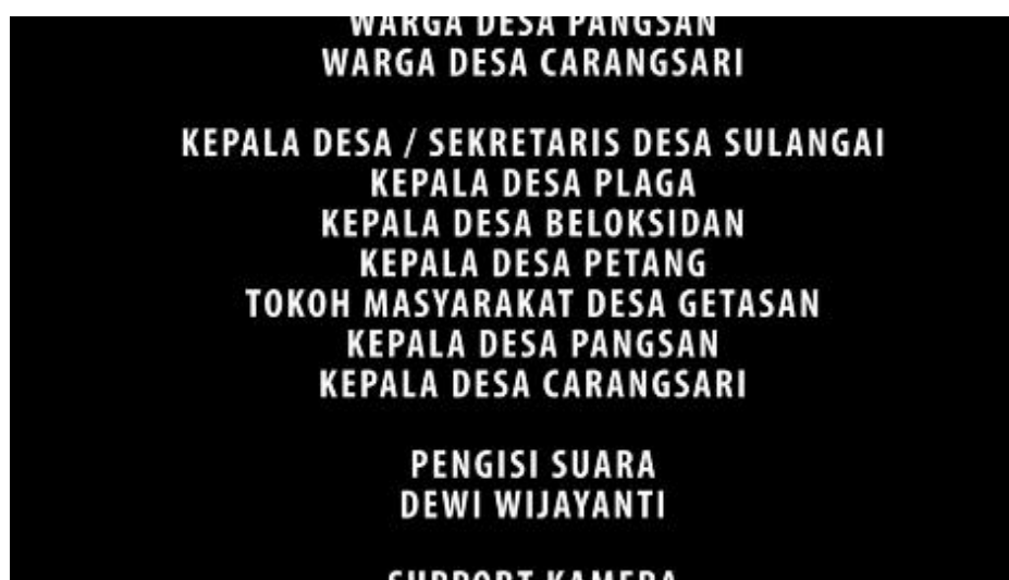
Figure 8. Credit and Thanks to all