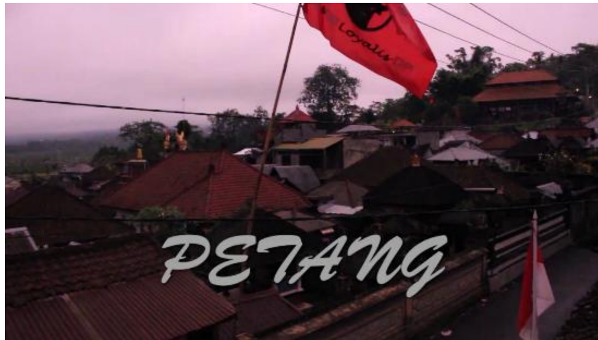
Figure 2. Opening