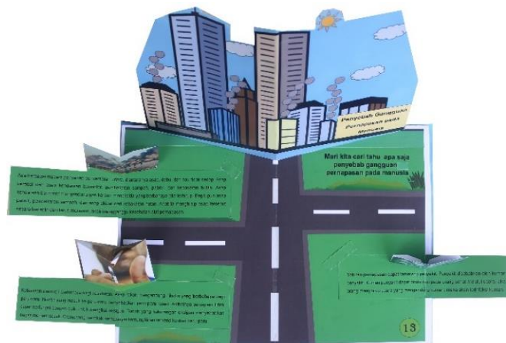
Figure 2. The Material of Pop-Up Book Media

Pop-up book media consisted of 16 pages including covers, instruction, table of contents, KD & Indicators, animal and human respiratory system material, and at the end of the page contained questions exercises. After the pop-up book media was finished, a product trial was carried out by four experts (two