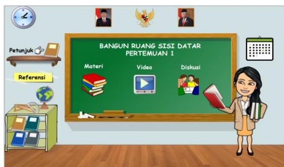
Figure 1. Learning Media

90.48%. Based on the acquisition of learning device expert scores, it can be concluded that the validity of the learning tools is in the very feasible category to be implemented. The learning media is validated by two experts from Educational Technology lecturers. The results of data analysis obtained Percentage average 90.00%. Based on the scores obtained by the instructional media experts, it can be concluded that the validity of the learning media is in the very feasible category to be implemented. After the validity test, the product was revised with reference to suggestions and comments from experts. The Fourth step is Implementation stage, this stage is the process of implementing flipped classroom learning. The implementation of flipped classroom learning is adjusted to the steps that have been prepared in the Lesson Plan. The self-study activity one week before the face-to-face schedule begins with creating a topic, creating a discussion column, distributing learning media, and providing practice questions.