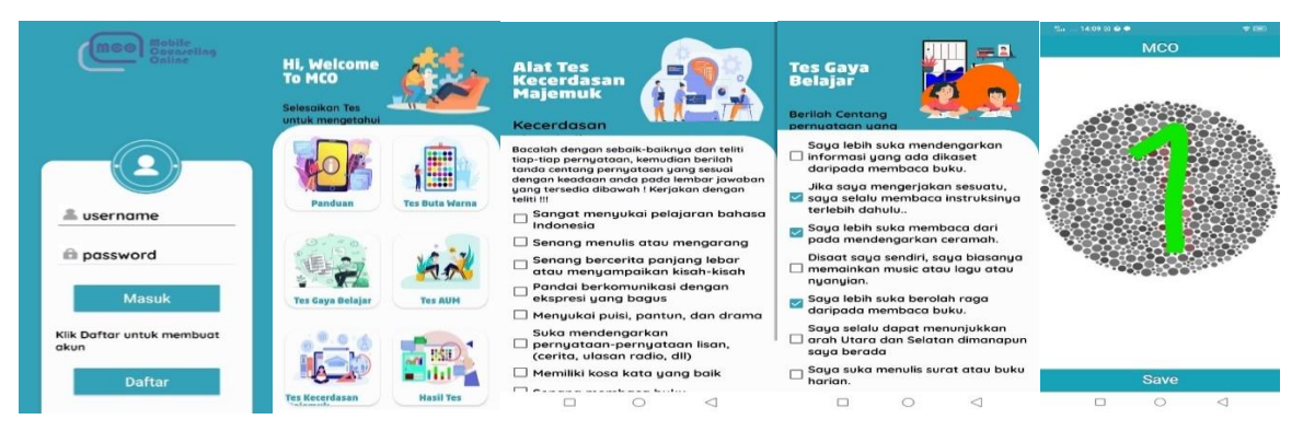
Figure 1. The innovation of online mobile counselling services (MCO)

MCO developed a variety of test tools that can help students understand their learning potential and help students develop and recognise effective learning strategies according to themselves. the novelty of MCO provides unlimited convenience and services with students using their respective smartphones. MCO have the quality of security, privacy and convenience that provide broad access and ease of use. In addition to loading some test tools and the results, MCO will be sent automatically to the user. MCO is also equipped with a room consultation feature with counsellors or psychologists that users can choose students. MCO prototypes that was developed to facilitate complete services for students with various features that make it easy for its users;