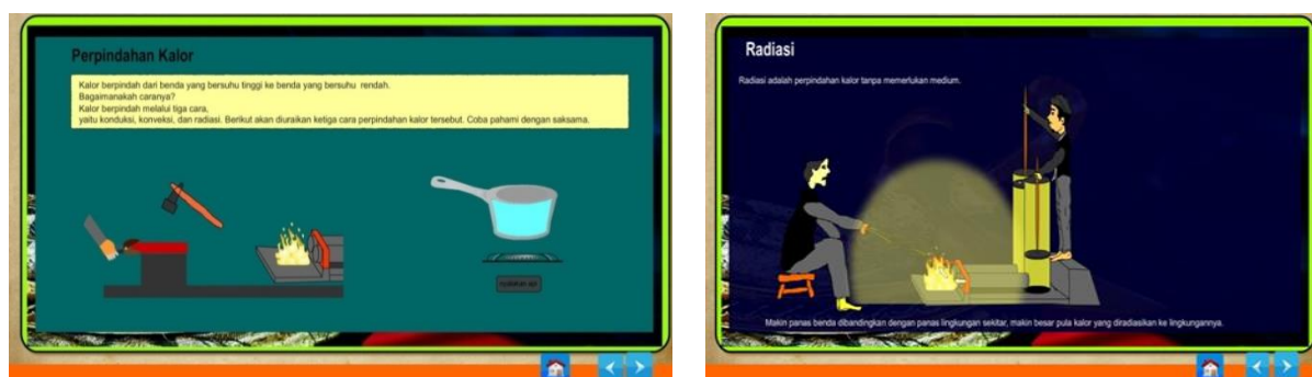
Figure 2. Display of Virtual Physics Laboratory Materials

At the development stage, the research product was realized so as to produce a virtual physics laboratory with real world problems based on the local wisdom of the Ngada community that could answer the needs of students and provide a quality lecture experience even though it was conducted online. The characteristics of the virtual physics laboratory learning media that were developed are that this product combines the delivery method, the way to do the practicum, and the learning style that provides the opportunity for participants to build active interactions in practical activities that occur online. Practical activities carried out through the virtual physics laboratory provide opportunities for students to get a quality lecture process independently without being limited by space and time. A number of case examples, pictures, simulations, videos and animations provided in this virtual physics laboratory contain elements of local wisdom of the Ngada community so as to provide an interesting and fun practicum atmosphere without reducing the value of quality learning. Virtual physics laboratory products are shown in Figures 2 below: