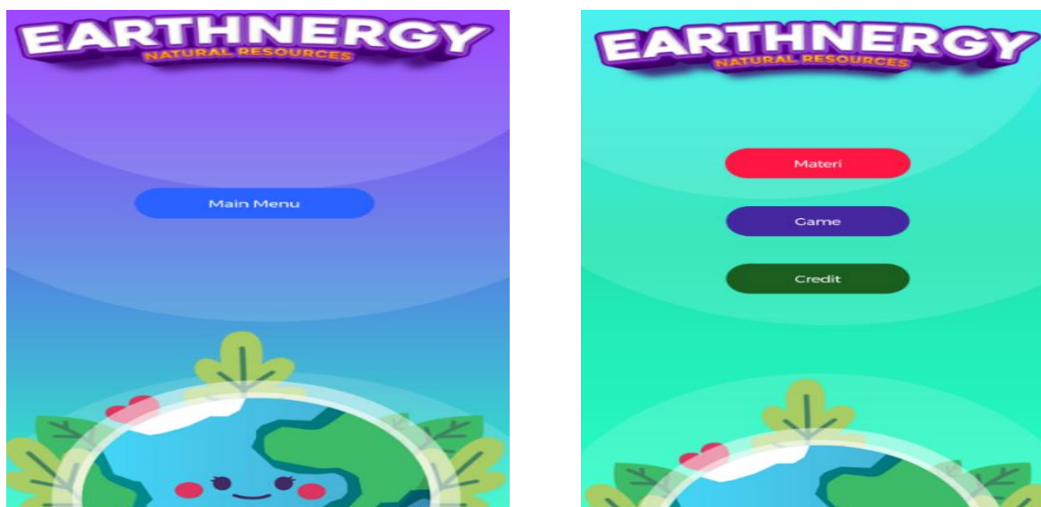
Figure 2. Main Menu Display