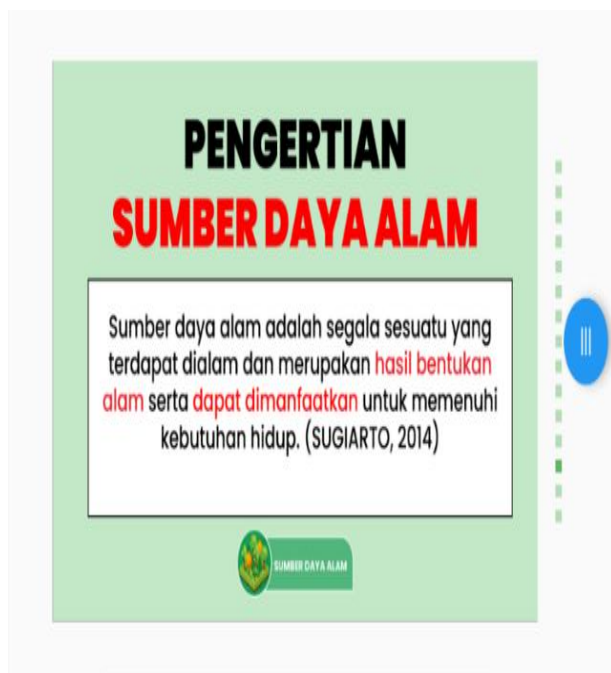
Figure 3. Material Display