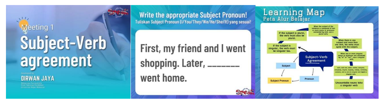
Figure 1. Some of the Results Of Product Revisions

The next stage was the development stage. This stage is the implementation stage of the product planning that has been carried out in the previous stage. The purpose of this stage was to produce a final product of English teaching materials that are suitable for use. The results of content and construct validity by experts obtained results with a percentage of 96% which indicates that English teaching materials are in the very valid category. Then the results of media validation by experts obtained a percentage of 91% which explained that English teaching materials were in the very valid category. Some of the results of product revisions are presented in Figure 1.