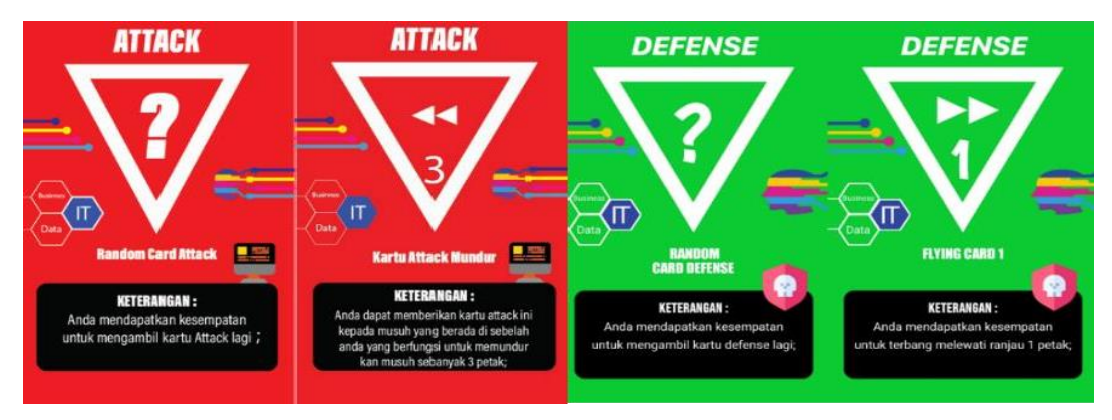
Figure 2. Attack and Defense Card

are listed in the card description. Defensive cards can be used to defend against opponent attack cards which can be used to defend a player's position in the game.