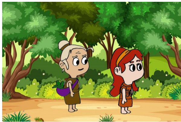
Figure 1. Character Sketches

From the results of the Pretest and Posttest assessments, it was found that there was an increase in the scores of students on fictional story material using digital-based story media, in improving students' speaking skills. The benefits obtained in the results of the study, digital-based stories can basically stimulate the work of students' brains, can improve children's language, can stimulate students' emotions, and through the stories presented by students can learn to interpret an event. Thus, it is found that media and learning models are mandatory for educators to provide to students. Interest in learning using interesting media will also affect the stimulus of students. Then expression itself can be regarded as a productive and expressive activity in channeling their creative ideas. More specifically, learning-based learning methods have a high level of identification that causes educators and students to know what difficulties are faced in the learning process. The sketch display of digital-based fiction story media is in Figure 1 .