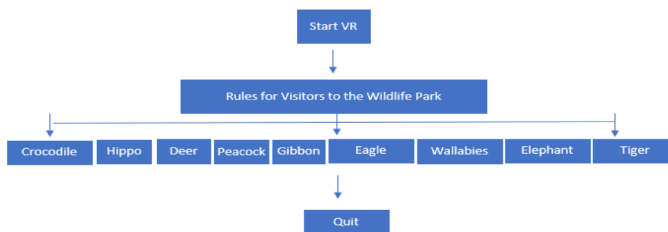
Figure 1. Flowchart Virtual Reality Animal Diversity

Design Stage. Based on the results of the needs analysis carried out at the define stage, at this stage the researcher formulates and produces several outputs, namely, 1) flowchart development, 2) storyboarding, and 3) the type and format of the application that will be used to make the initial virtual reality product before being tested to experts and teachers at a later stage. Flowchart virtual reality animal diversity is show in Figure 1.