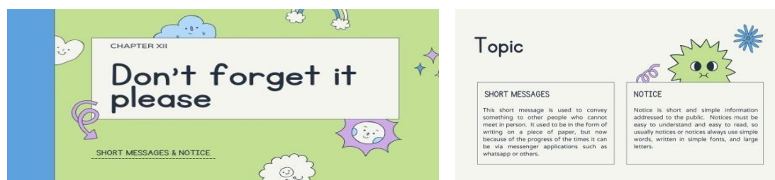
Figure 2. Developed Product

The results of the content assessment on audiovisual learning media using the Canva application for eight grade students with an average of 91,5% or in the very good category. In this study, the minimum qualification for validation on audio-visual-based learning media through the Canva application for eight grades reached the good category. The validation results show that the development of the Canva application in designing audio-visual-based learning media is suitable for learning media at SMP N 4 Pekanbaru. Opinions or suggestions obtained at the validation stage will be used as a reference for improving the development of the Canva application which has been developed into an audio-visual-based learning media. Developed products are presented in Figure 2.