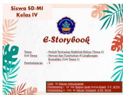
Figure 2. Cover Creation Stage

The next stage is the implementation stage. In this implementation stage, it is a stage of applying the developed product to the test subjects involving grade IV students at SD Negeri 4 Pemecutan. The purpose of this implementation is done to know the user's response to the learning media E-Storybook material plant parts and functions. In addition to knowing the feasibility and attractiveness of a product that has been developed so that when tested on the subject then the product already has a better quality and worth using. The last stage is to evaluate. This stage is divided into formative evaluation and summative evaluation. Formative evaluation is done to collect data at each stage used for improvement and summative evaluation is done at the end of the program to know its influence on the learning outcomes of learners and the quality of learning at large. The product test stage was conducted first by 3 experts, namely subject content experts, learning design experts and learning media experts. Furthermore, after the media is declared viable then a product trial is conducted. However, this stage was conducted only until individual trials by 3 grade IV students at SD Negeri 4 Pemecutan. Instrument used in the assessment in the form of questionnaires. Product trial activities are conducted to determine the feasibility of the product being developed. The following is the exposure of the results of the test process by experts and individual trials.