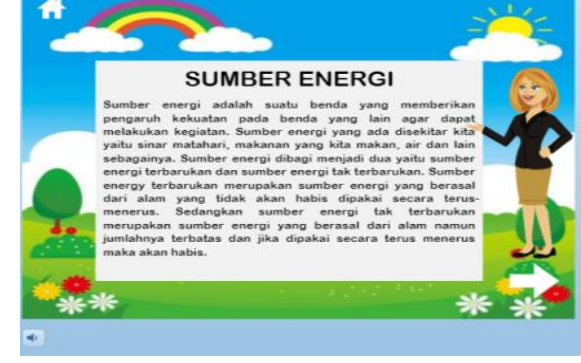
Figure 3. Material Section