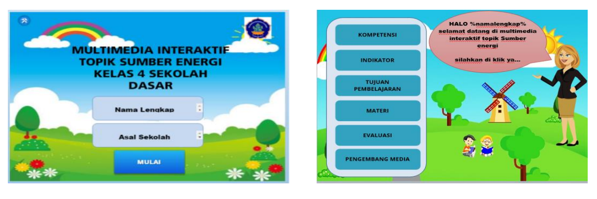
Figure 1. Opening Section

The development stage is carried out with media development. The media is developed according to the design that has been made. Making media adapts to needs analysis, curriculum analysis, material analysis that has been done previously. The media is made using the articulate storyline application 3. After the media has been developed, it is assessed by 4 lecturers, 2 teachers and 9 students by providing media assessment sheets. This development research produces a product in the form of interactive multimedia-based learning media on the topic of energy sources for class IV Elementary School. Here are some media views that have been created.