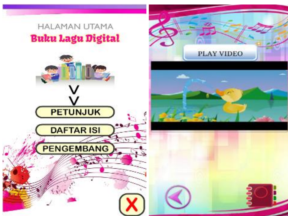
Figure 1. Digital Songbook Display