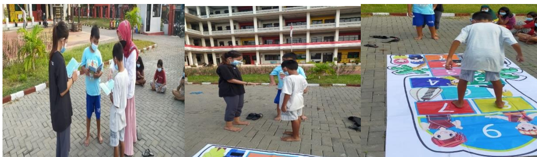
Figure 2. Field Trial Process Using Engklek Karakter (EKA) Game Media

This Engklek game media (EKA) contains a game arena that has illustrations of cultural diversity in Indonesia, besides that go (throwing tools) has illustrations of diversity that exist in Indonesia ranging from tribes, regional dances, and regional clothing. In addition, there are question cards containing questions about the application of nationalist character (love for the homeland), and various questions about the diversity of Indonesian tribes and cultures. These questions are designed with the intention that students are more familiar with Indonesia with its diversity of tribes and cultures, as well as instilling nationalist values that are expected to be achieved according to competence in civics learning. The results of the study, it has been tested with elementary school students, based on observations of enjoying the form of the Engklek Character game. Students are happy and happy, cheerful and enthusiastic in doing their games. Field trial process using engklek karakter (EKA) game media is show in Figure 2 .