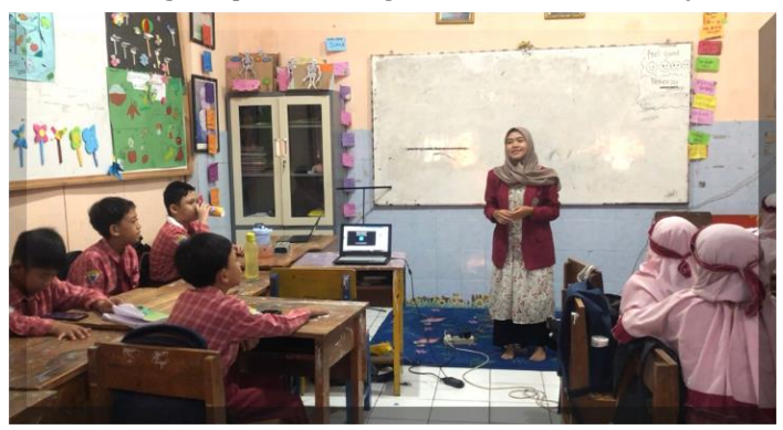
Figure 1. Observation of Wordwall Learning in Class

Based on the observations on aspects of internal word wall implementation learning in the classroom, the word wall digital platform is new in SD Muhammadiyah 2 Surabaya. The principal's opinion reinforces that deep Word wall implementation is new for digital-based learning. Learners are also enthusiastic about participating in class learning so that learning becomes more fun than conventional learning, and students do not feel bored when learning takes place. Meanwhile, based on digital literacy ability, it is known that students are capable and proficient in operating digital technology word wall templates chasing in a maze and matching games from the beginning to the end of the game. Students have skills in viewing images visually, audio, moving the screen or cursor, reading, and answering the questions in the game correctly. The following is a photo during the observation activity.