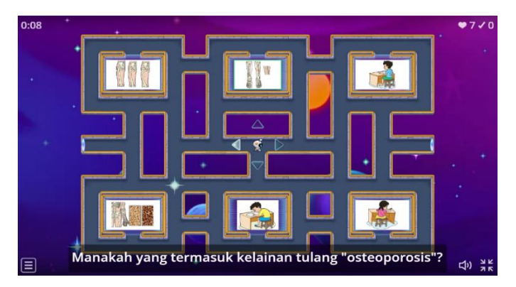
Figure 2. Chase in the Maze

Based on Figure 1 shows the implementation of word wall implementation activities during class learning. In Figure 1, it can see that the students were delighted, enthusiastic, and excited when implementing the word wall in learning took place in class. Based on the results of interviews conducted by researchers with all informants regarding the application of word wall-based game-based learning in classroom learning, it is a new thing that makes students interested, not bored, and learning becomes more exciting and fun. Not only that, but students are also very enthusiastic, so the material taught is easy to understand. The application of word walls in classroom learning is more interesting than conventional learning. Therefore, students' digital literacy is also good because students can use digital word wall technology through their gadgets. The obstacles experienced were that some students needed gadgets, and the internet network was constrained. Based on the opinions of all sources, it stated that every week there is a need for digital learning, but still paying attention to the limitations and directions in using digital literacy so that students do not fall into negative influences. The following was a display of activity documentation from researchers conducting research at SD Muhammadiyah 2 Surabaya.