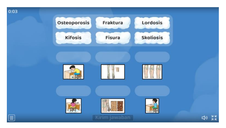
Figure 3. Matching Game

Figure 2 shows the view of the word wall template for the maze chase game, while Figure 3 shows the matching game template. Based on these two images, there are visual images, text, and audio.