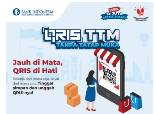
Figure 1. Contactless QRIS

If previously we imagined that all of digital wallet applications could be combined into one code that was realized through QRIS on January 1, 2020, now we can make contactless payments with merchants (Mayanti, 2020). People who want to make transactions can simply save the merchant's QRIS on their cell phone, upload the merchant's QRIS to e-wallet application, and pay for products or services according to nominal. Contactless QRIS is used to support online shopping without face to face, so it will reduce the risk of contracting COVID-19.