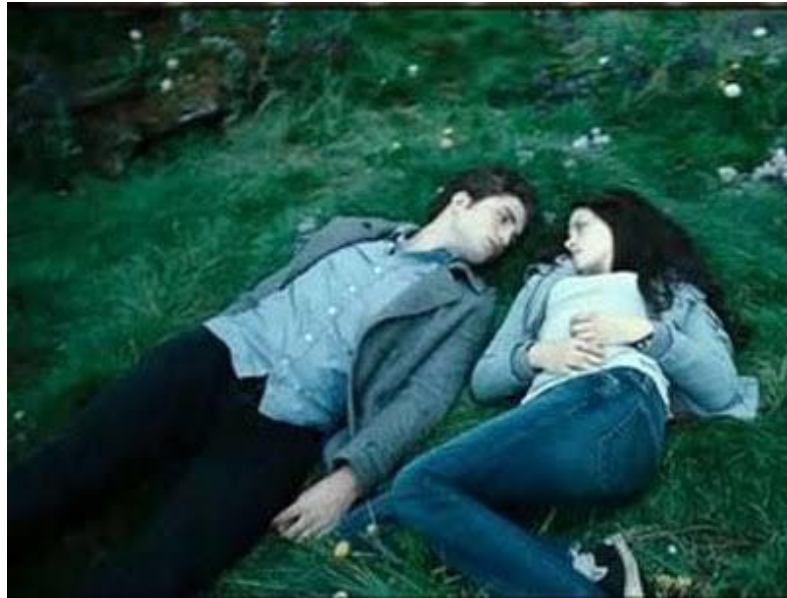
Figure 3. Bella found out that Edward was a monster