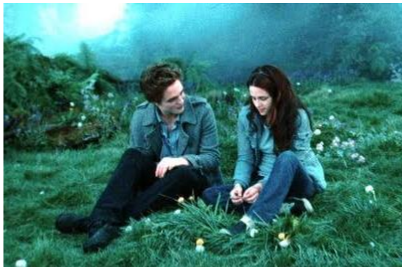
Figure 4. Edward telling about his family

Those figures represent posture as the nonverbal language used by the female and male character in the movie entitled "Twilight". From both figures, the second and the third figure can be seen that the male's posture is braver than the woman's posture. The second figure consist of: touching behavior, sticking arms together between the object, and arms sticking parallel to the body. People mostly use a hand gestures while they communicate and interact with others. People spontaneously move their hand to emphasize what they are trying to say to others. On the second figure, the male character is sticking his arms together