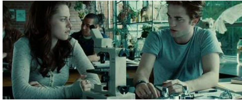
Figure 1. Edward met Bella for the second time

From Figure 1, it can be seen that the male character uses brief eye contact to the female character. The male character stares into the female's eyes while they were having conversation. The man character combined his eye contact with bending his eyebrows briefly. It signals a serious or curiosity. Social context of his gesture is that Edward Cullen as the man character tends to use this eye contact to get some information related to the female character, Bella Swan. It is also proved that the male character, Edward Cullen has a great curiosity. The female character on the other hand uses dim eye contact while talking to the male character. She also combined her dim eye contact with gaping lips. It proves that the female character wonder with the man character expression towards his eye contact. And it also proved