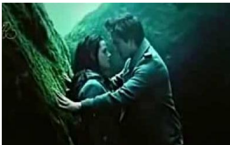
Figure 2. Bella found out that Edward was a monster

The use of posture of the male and female character in "Twilight" movie can be seen in the Figure 2, Figure 3 and Figure 4. Figure 2 and 3 are taken from the part when the female character (Bella Swan) knows the real information about the male character (Edward Cullen) that is the male character is a "Vampire". But the female character did not care about the truth although the male character has told the female character that he is a dangerous "Blood Monster". While Figure 4 is taken from the part when Edward tells his "Vampire" family to the female character (Bella Swan).