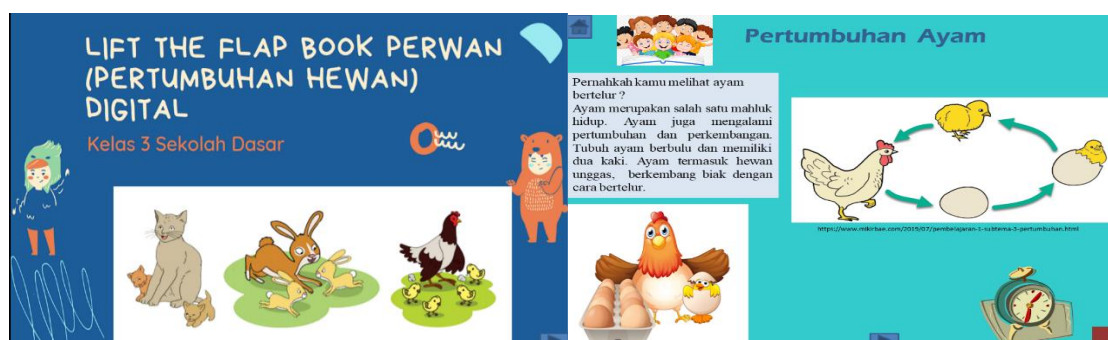
Figure 1. The Flap Book Digital

The statement in the questionnaire on students' interest in learning science during this pandemic proved that there were two statements that grade III elementary school students had low interest in learning science, namely the fourth statement. This result showed that 58.3% of students answered that they disagreed if they had to pay attention to the teacher while explaining the material, and the seventh statement was 62.5%. Students answered disagree if students were led to actively ask the teacher if they had difficulty understanding the material. Therefore, researchers provide a solution to increase interest in learning science for grade III elementary school students with digital lift the flap book media. Media Lift The Flap Book Digital, which was developed in this research known as Lift The Flap Book Perwan (Animal Growth) Digital, is designed through a flowchart with three parts: introduction, content, and closing. The introduction section of the Media Lift, The Flap Book Digital, contains pages, namely a cover, foreword, and instructions for use. The second part has orientation, learning materials, and evaluation. The closing section includes a glossary, bibliography, and profile. The results of the development of the Digital Flap Book media are presented in Figure 1. Media validation related to the media aspect of Lift The Flap Book Digital is carried out through the validation of media, language, and material experts. The validation results in the Table 2.