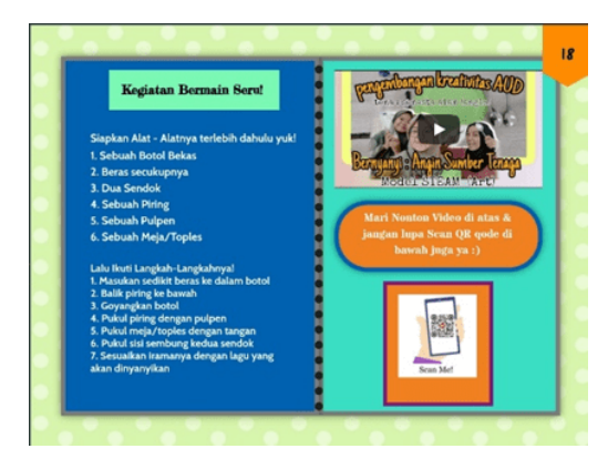
Figure 6. Development of Artistic Creativity (Art)

according to their stage of development. Art development is very important for children's emotional development. This skill can greatly improve children's ability to understand other people's feelings so they can act quickly. The level of achievement of early childhood artistic development consists of the level of achievement of various artistic works and skills, such as drawing, painting, finger painting, finger stamping, origami, meronce, musicality, various expressions of gross motor movements, fine motor skills, crafts, various mini performances drama, singing, telling stories, dancing, and various processing of objects that can be used into other goods. Based on the results of the art creativity development questionnaire (figure 7), it was found that the e-book innovation of early childhood creativity development in this art activity, 66.7% of students stated that the e-book image design was made attractive, 66.7% stated the essence of art material understandable, 55.6% of song selection relates to art playing activity material, 66.7% of the art playing activity selection can be followed by children and 68.5% of art playing activity video tutorials can be understood. The appearance of the development of artistic creativity can be seen in Figure 6.