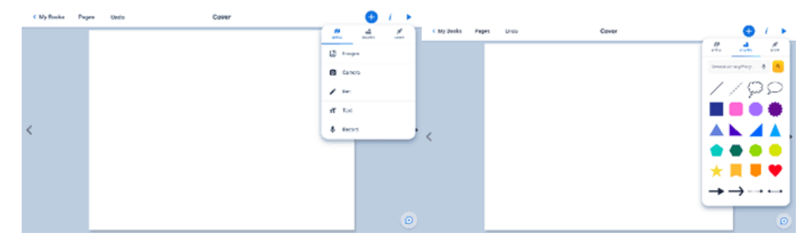
Figure 1. The E-book Creator Application

Based on the results of the data analysis that has been carried out, several findings were found in this study, including first, out of 54 students of UIN Sunan Gunung Djati Faculty of Tarbiyah and Teacher Training in the PIAUD Department, 100% of students know about book creators. From this provision, it will be easy for lecturers to provide explanations for making e-books and utilizing the tools available in the book creator. Book creator is equipped with tools to add files in documents, images, recordings, videos, and text. It makes it easier for users to make books according to their creativity. To make it look attractive, you can also use the Canva application to create images that will later become book backgrounds. Not only that, adding songs and videos can be easily added. If the video file is large, you can use a link that will later connect to YouTube or Google Drive. The display of the e-book creator application can be seen in Figure 1.