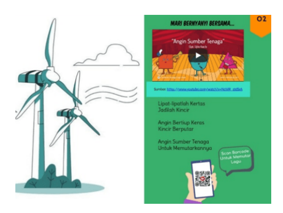
Figure 2. Selection of Activity Songs According to the Theme

The second finding shows that 83.3% of the songs used are according to the theme. Meanwhile, 66.7% of the songs used in this e-book come from YouTube. Meanwhile, 22.2% used self-made songs, and 22.2% edited the songs well. Furthermore, as much as 3.5% use songs from other sources. In this e-book, the songs chosen are the wind as a Source of Energy (p.02), my balloon (p.12), and The Song of the spinning fan (p.22). The lyrics section provides text using English and Indonesian (p.16). The song activity selection display can be seen in Figure 2.