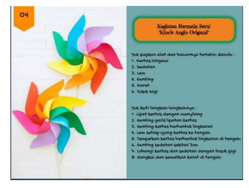
Figure 3. Development of Scientific Creativity (Science)

The fourth finding shows that the second play activity for developing STEAM-based early childhood creativity is the use of technology. Technology is used as a medium for conveying interesting and interactive learning messages. In this non-stop development, the world of education cannot escape the need for technology, which ultimately changes learning patterns for developing creative and innovative skills. Based