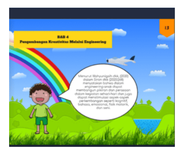
Figure 5. Development of Engineering Creativity

The fifth finding relates to the development of engineering creativity. Engineering is the ability to engineer technological developments. Kipper in Siron states that early childhood engineering abilities must be developed more deeply. Engineering content can be the main guide in learning because the field emphasizes psychological aspects and social interactions, which are important factors in learning—starting with identifying the problems faced and then looking for solutions. For example, students try to transfer water from one bucket to another using a dipper, then build thoughts and ideas by looking for other tools that can be faster, for example, using a hose and water pump. It is where aspects of cognitive, language, emotional, physical development, motor, and art are grown. Based on the results of the engineering creativity development questionnaire, it was found that the e-book innovation of early childhood creativity development in this engineering activity, 53.7% of students stated that the e-book image design was made attractive, 72.2% stated the essence of engineering material was understandable, 50 % of song selection relates to engineering play activity material, 57.4% of engineering play activity selection can be followed by children, and 64.8% technology play activity video tutorials can be understood. The display of engineering creativity development can be seen in Figure 5.