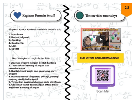
Figure 7. Development of Mathematical Creativity (Mathematics)

The seventh finding relates to mathematical creativity. Mathematics is important to equip early childhood to think logically, systematically, critically, analytically, full of new ideas, and social skills. Developing the concept of learning mathematics in early childhood can be done, among other things, by developing the concept of numbers in children, developing concept patterns and relationships, developing the concept of geometrical relationships, developing the concept of measurement, developing the concept of collecting, organizing and displaying data. Based on the results of the mathematical creativity development questionnaire (figure 8), it was found that e-book innovations developed early childhood creativity in this mathematical activity, 57.4% of students stated that the e-book image design was made attractive, 79.6% stated the essence of mathematical material understandable, 53.7% of song selection relates to math play activity material, 64.8% of math play activity choices can be followed by children, and 59.3% math play activity video tutorials can be understood. The display of mathematics creativity development can be seen in Figure 7.