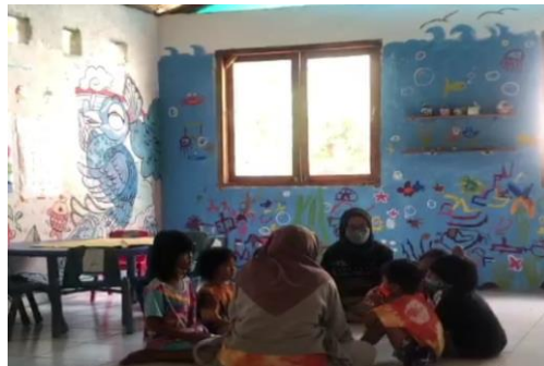
Figure 2. The Initial Activities

Second, core activities at Gajahwong School start at 09.00 WIB, where educators hold discussions with children to create several agreements and mechanisms for learning activities. Before carrying out the core activities, the educator first asks the children about the day, date, month and year as in Figure 3 . The children then write the letters one by one according to the child's wishes on the board provided by the educator. The core activities at Gajah Wong School include: projects, areas, motorbikes, and trips. The introduction of the day, date, month and year is presented in Figure 3 .