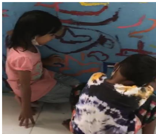
Figure 4. The Children Presenting Their Work

Tolerance implemented at Gajahwong School includes: mutual respect, care, respect for friends' opinions, and cooperation between children. First, the attitude of mutual respect at Gajahwong School can be seen during learning activities, where when children explain their work drawings on the wall, other friends pay close attention. The children's activities for presenting their work are presented in Figure 4 .