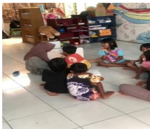
Figure 3. The Introduction of Day, Date, Month and Year

Second, core activities at Gajahwong School start at 09.00 WIB, where educators hold discussions with children to create several agreements and mechanisms for learning activities. Before carrying out the core activities, the educator first asks the children about the day, date, month and year as in Figure 3 . The children then write the letters one by one according to the child's wishes on the board provided by the educator. The core activities at Gajah Wong School include: projects, areas, motorbikes, and trips. The introduction of the day, date, month and year is presented in Figure 3 .