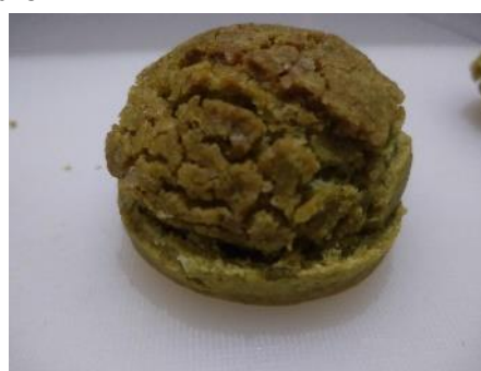
Figure 2. Results of Gluten Free Moringa Choux Paste 6 gram Moringa leaf flour formulation (A2)

formulations by the panelists. of 4 indicators, namely aroma, color, taste, and texture. The results of Gluten Free Moringa Choux Paste 6 gram Moringa leaf flour formulation (A2) can be seen in Figure 2