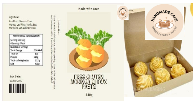
Image 3. Examples of packaging design designs, packaging, product logos