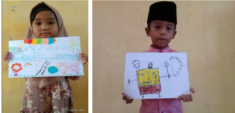
Some students of IGRA Kindergarten and their work.