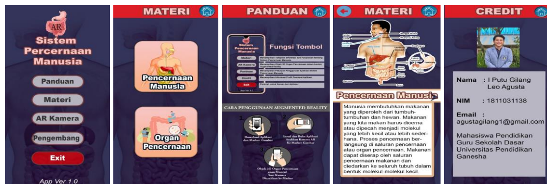
Figure 2. Results of Augmented Reality Development

Experts then assess augmented Reality. The assessment carried out by learning material experts got 4.85, the average score with a range of 4.0 < X < 5.0 , so it was very good. The learning media expert assessment results are 4.83, the average score with a range of 4.0 < X < 5.0 , so it is very good. The teacher's response validation results are 4.62, so it is very good, and the student response is 4.7, so it is very good. It was concluded that Augmented Reality got good qualifications and deserved to be used.