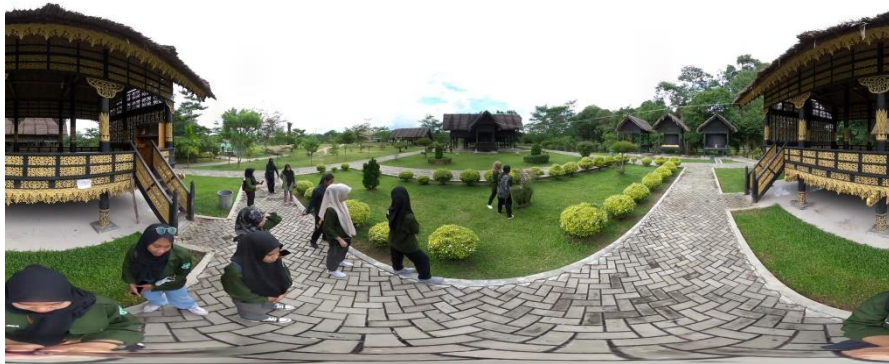
Figure 3. A 360° view of the Aceh Traditional House (Destination Object)

After developing the 3D Street Story Map, a practicality test was carried out. The practicality test aims to assess the attractiveness of learning media and the ease of use of learning media for high school students. We conducted a practicality test at SMA Negeri 5 Langsa. The practicality test results were then analyzed and presented. Furthermore, the practicality test results of the 3D street story map media provide the results presented in Table 6 .