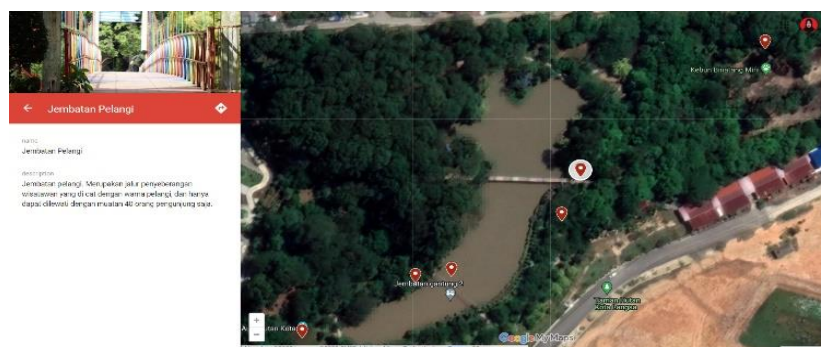
Figure 2. Map Display When Opening A Description of Each Location

The coordinate points in Figure 1 , if clicked, will display information related to tourist objects and important information on the object. The display of the 3D street story my map learning media on the tourist attraction site information display in Figure 2 .