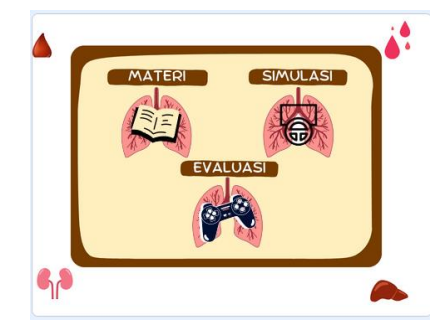
Figure 3. Home Page Display

After the stage of designing and making media using various software, the next stage is media product validation. This validation involves experts to test and evaluate whether the media product meets the expected quality and effectiveness standards. After that, the product is also tested on students to