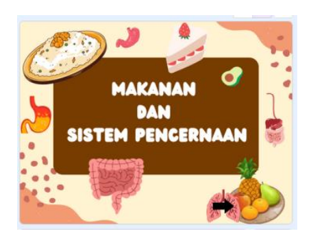
Figure 2. Main Page Display Figure

The "Development" stage is the phase where the results of the previous analysis and design are realized into ready-to-use media products. In this stage, visual elements such as background images are created using Canva. Then, the previously prepared supporting components of the app are integrated according to the storyboard layout designed using Canva and Scratch, ensuring perfect integration of all elements. The development process involved programming using the Scratch app, which uses a block-based programming approach. The implemented code was tested to ensure that the functions within the media operated according to the defined storyboard. Examples of the results of this development stage are shown in Figure 2, and Figure 3.