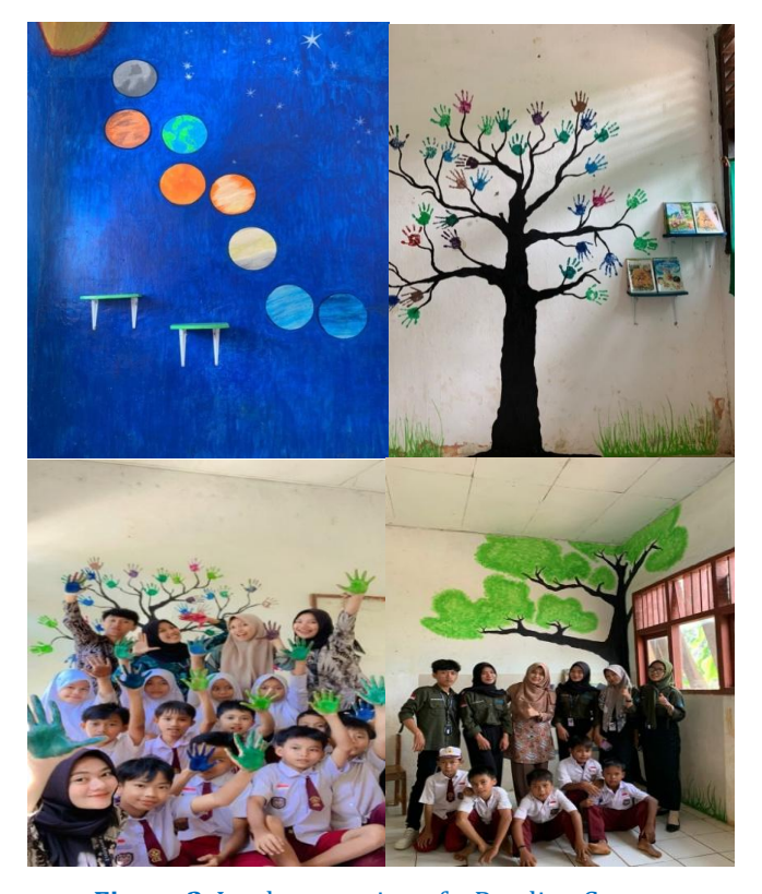
Figure 2. Implementation of a Reading Corner

The second stage was the implementation of the reading corner program at Kupitu State Elementary School. Students created and implemented the reading corner program in grades 4, 5 and 6. The reading corner is a space specifically designed to attract readers' attention, by providing easy access to various types of books. according to their interests and needs. In this reading corner program, students can create a comfortable and interesting environment for students at Kubuhitu State Elementary School, such as book discussions, story reading, or reading competitions. With the right approach, it is hoped that the reading corner can become an effective source of inspiration to increase interest in reading in the community. The following is Figure 2 which is documentation of the creation of a reading corner in the high class of Kuhitu State Elementary School.