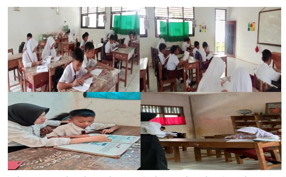
Figure 3. Implementation of Reading and Writing Guidance at the Kuhitu State Elementary School

One of the steps in efforts to foster a culture of literacy or interest in reading at SDN Kubuhitu is through literacy and numeracy guidance activities. This activity is used as a means to maximize interest in reading and writing. The school has arranged a schedule of regular visits to the reading corner. Apart from that, reading and writing tutoring programs are held every Monday and Tuesday, while numeracy tutoring is held every Thursday, all after the first break at 09.30.