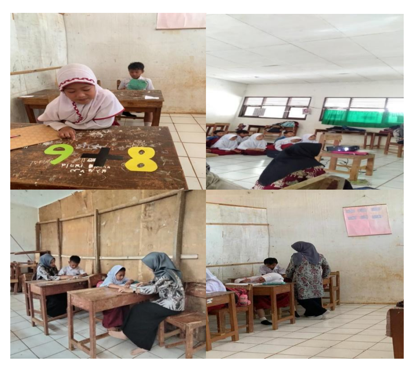
Figure 4. Implementation of Numeracy and Numeracy Guidance

multiplication origami paper as a learning medium. They can also memorize multiplication, subtraction and addition material through the question-and-answer method and listening via a video projector with the campus teaching team. In the picture below, the activities of counting, calculating and watching a video projector are shown.