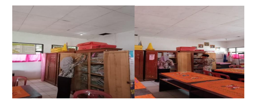
Figure 1. Book Selection and Book Arrangement

In Figure 1, it can be seen that campus teaching program students make plans and select books at Kubuhitu Elementary School. Book selection is an important process that involves determining relevant and quality material to meet readers' needs. After selection, the preparation of the book is carried out by systematically organizing the content so that it is easy to understand and access. Both contribute to a better reading experience and increase the reader's understanding of the topics discussed, we select books suitable for the reading corner which must be appropriate to the age and interests of the target reader, choosing a variety of genres and themes so that readers have many choices and can find something that is interesting to them. Finally, the quality of the book, both in terms of content and design, must also be considered so that it can provide a pleasant and useful reading experience.